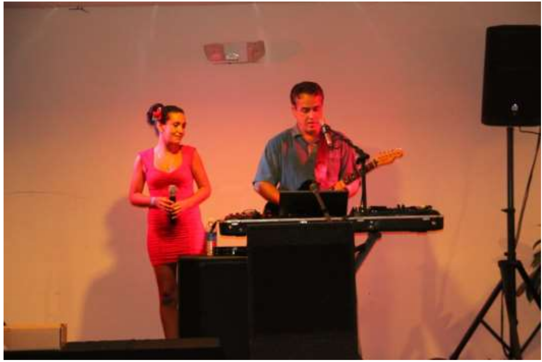
Saturday Night Entertainment