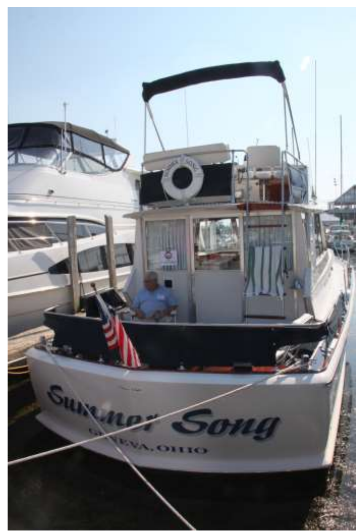
Summer Song 1967 38' Sedan FB, Presented By: Ron Smoker