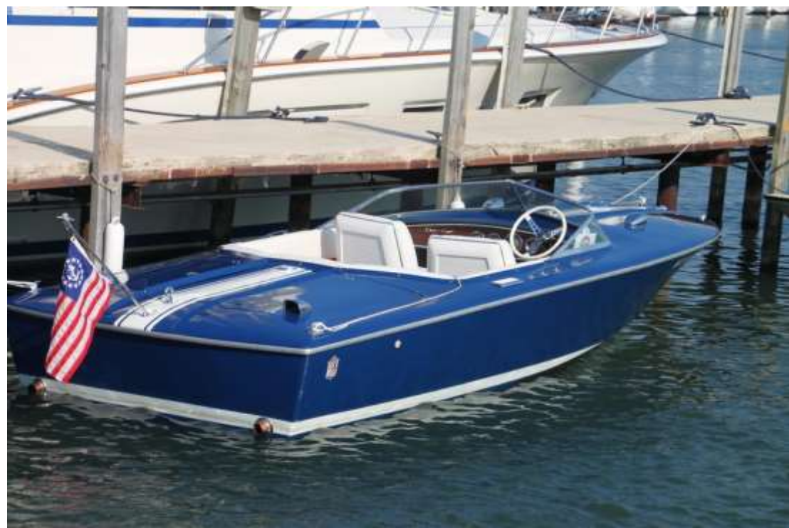
1969 19' Super Sport, Presented By: Gary Cornillie