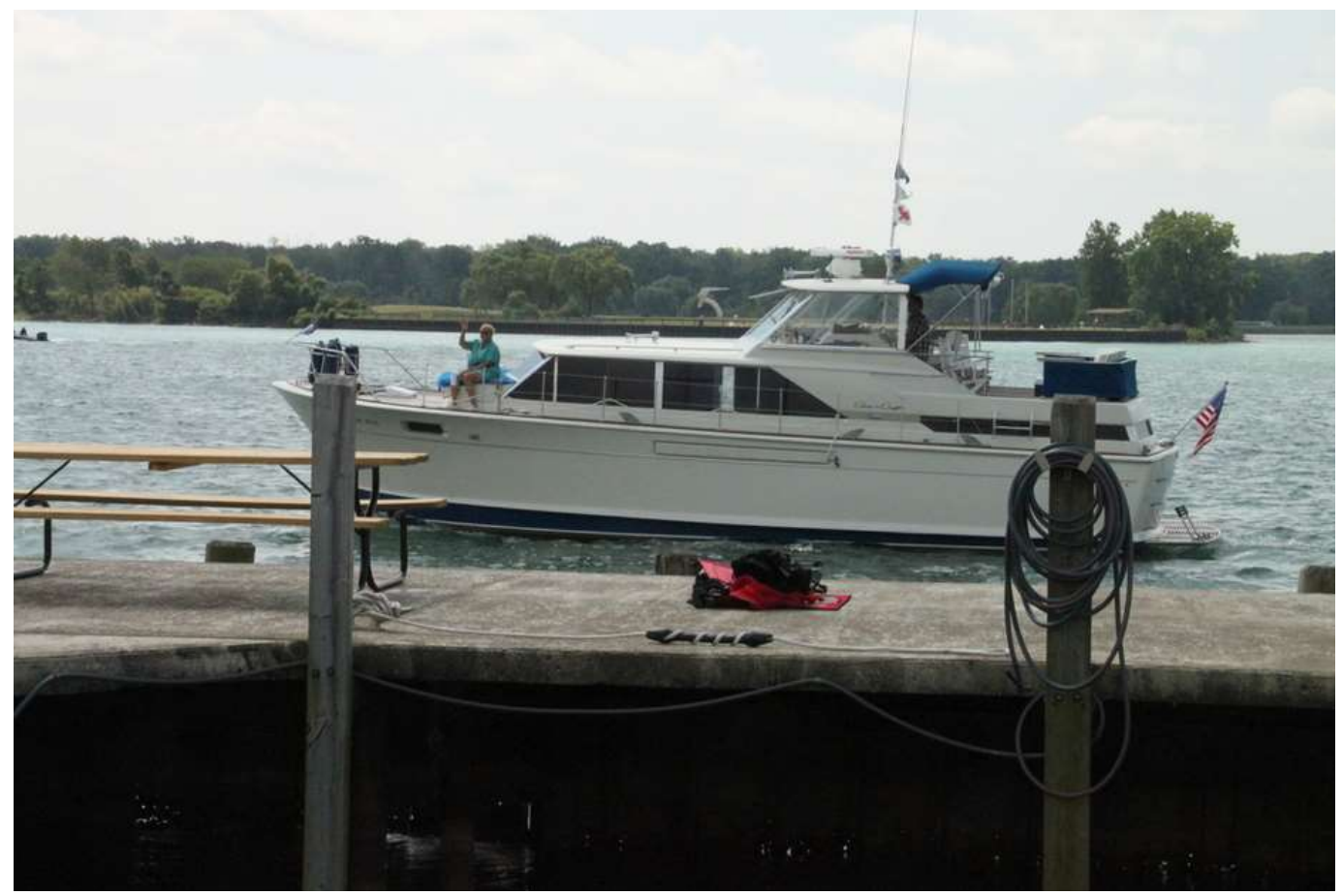
We believe this was 42' coming to join the party.