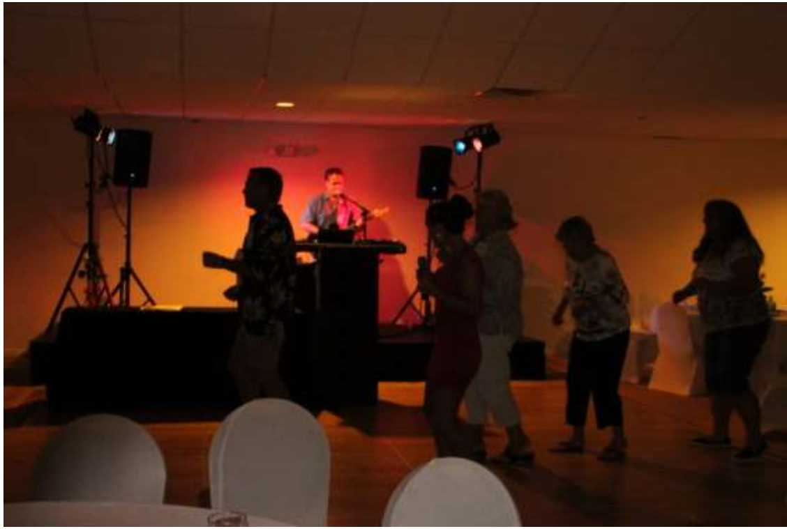
Members kicking up their heels