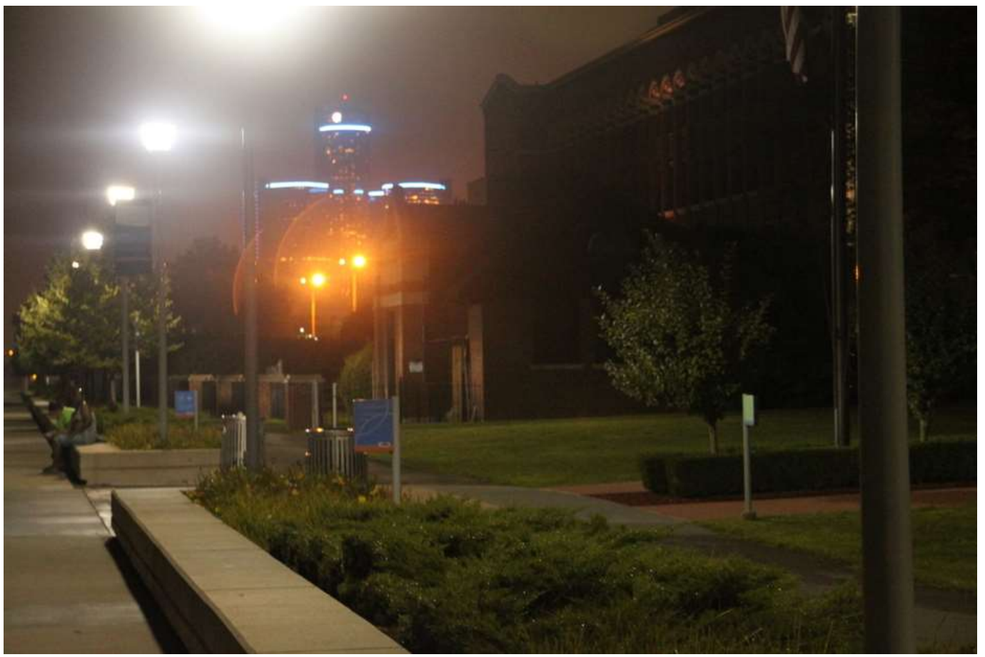
Downtown Detroit From Roberts Riverwalk