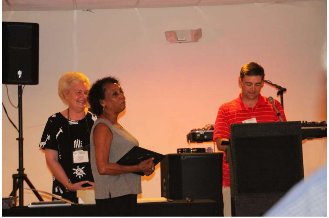
The Award Of Distinction presented to Roberts Riverwalk