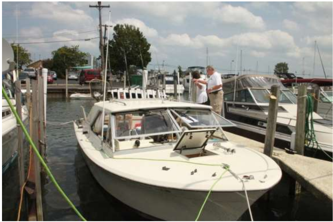
Bearhooks 1969, 27', Presented By: Ron Draper