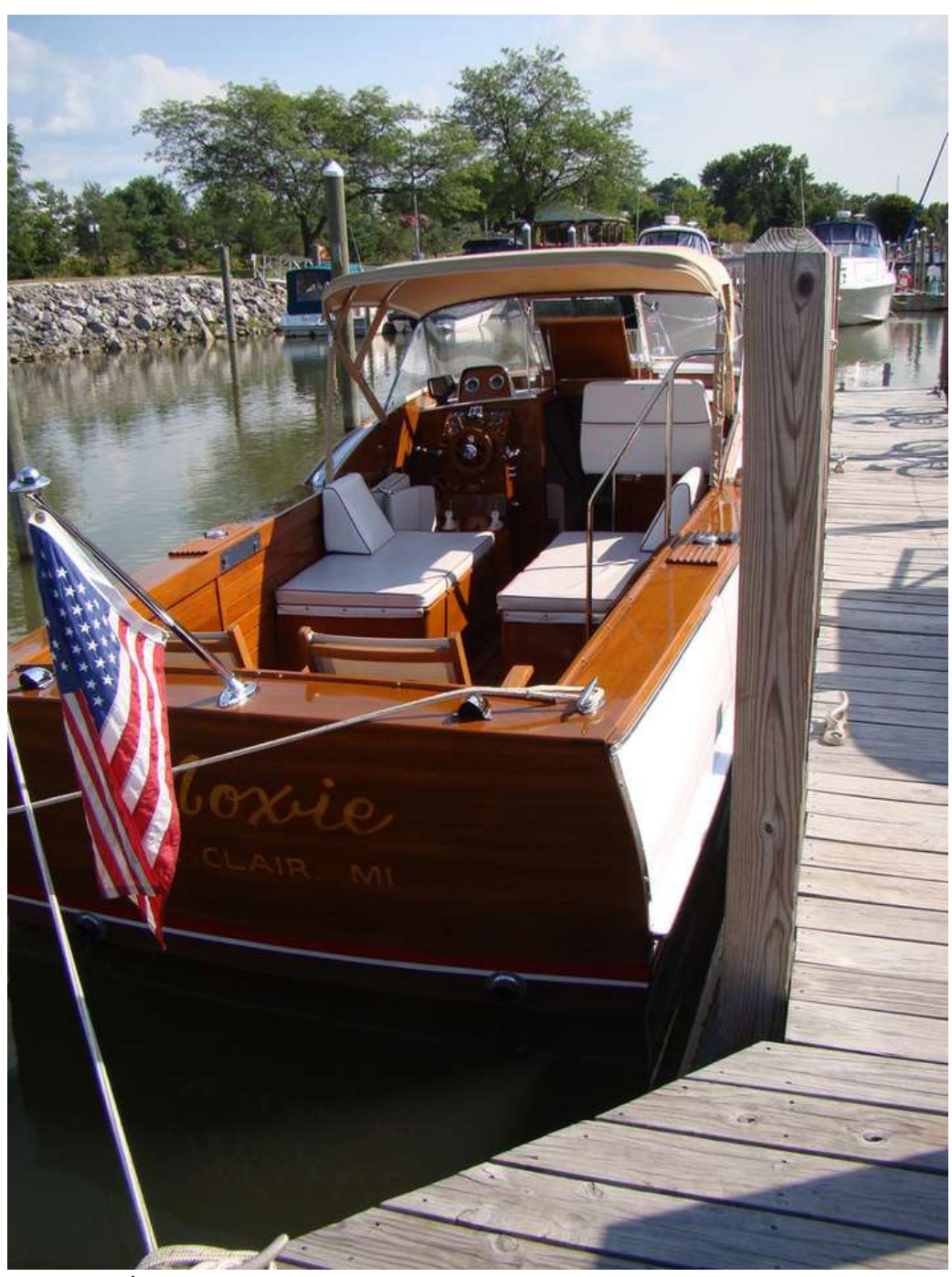
1957 CC 26' Sports express