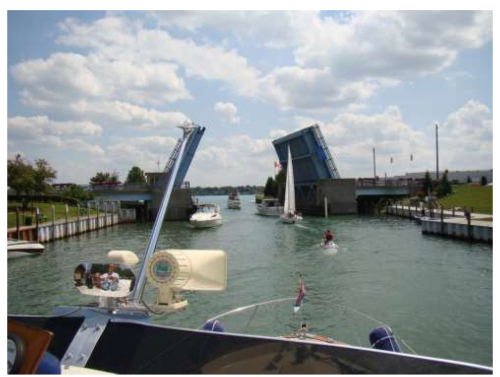
ST CLAIR RENDEZVOUS LEAVING THE PINE RIVER