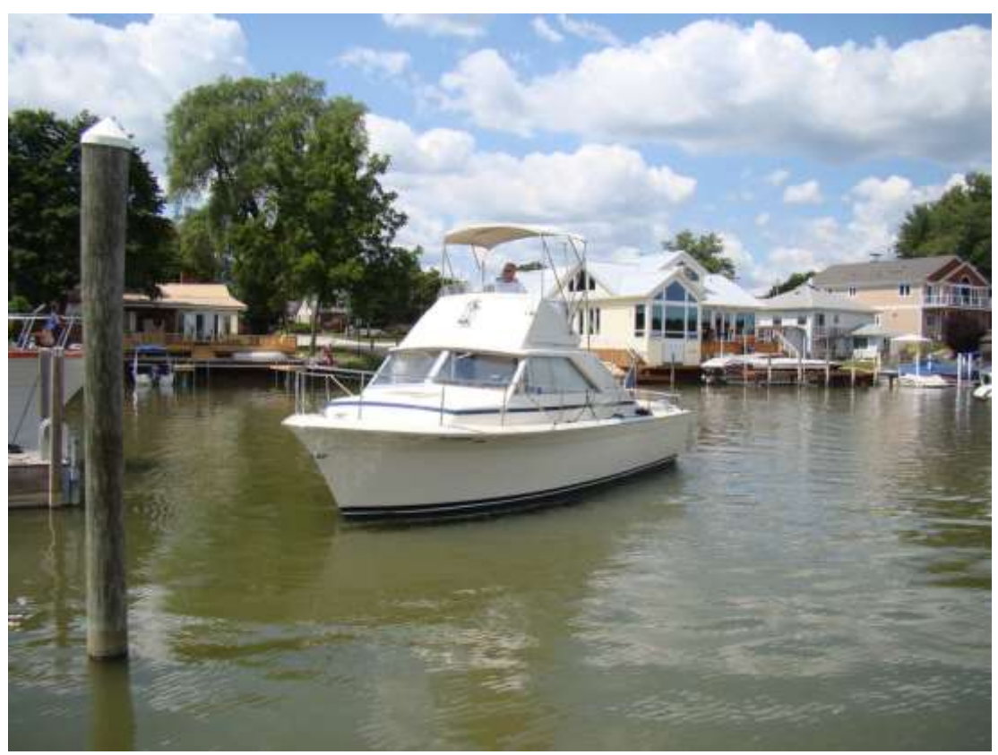
31 Sport Express 1968