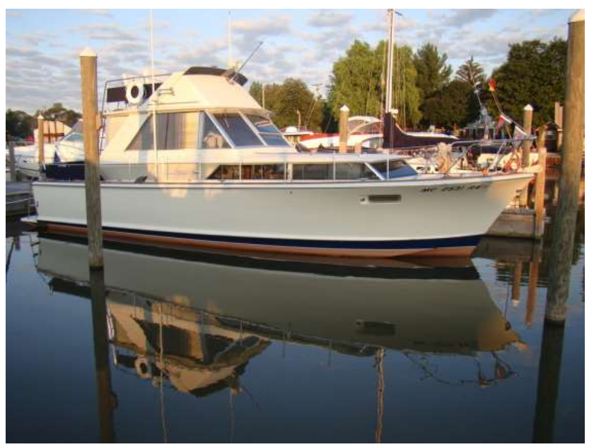
38 Sedan Flybridge 1968