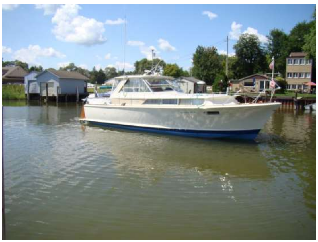
38 Express 1964