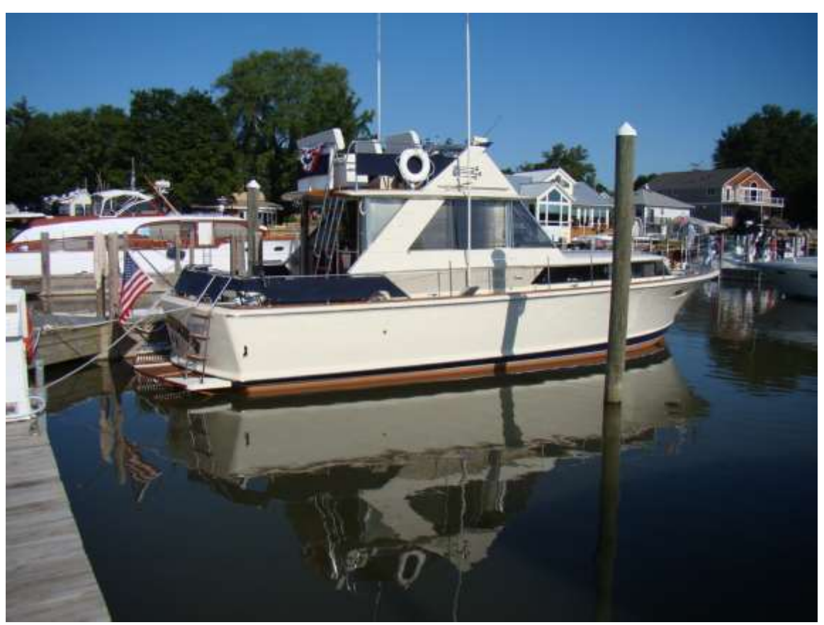
38 Sedan Flybridge 1968