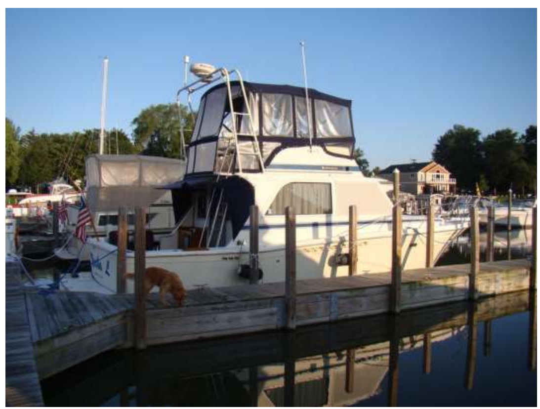
382 Commander 1985