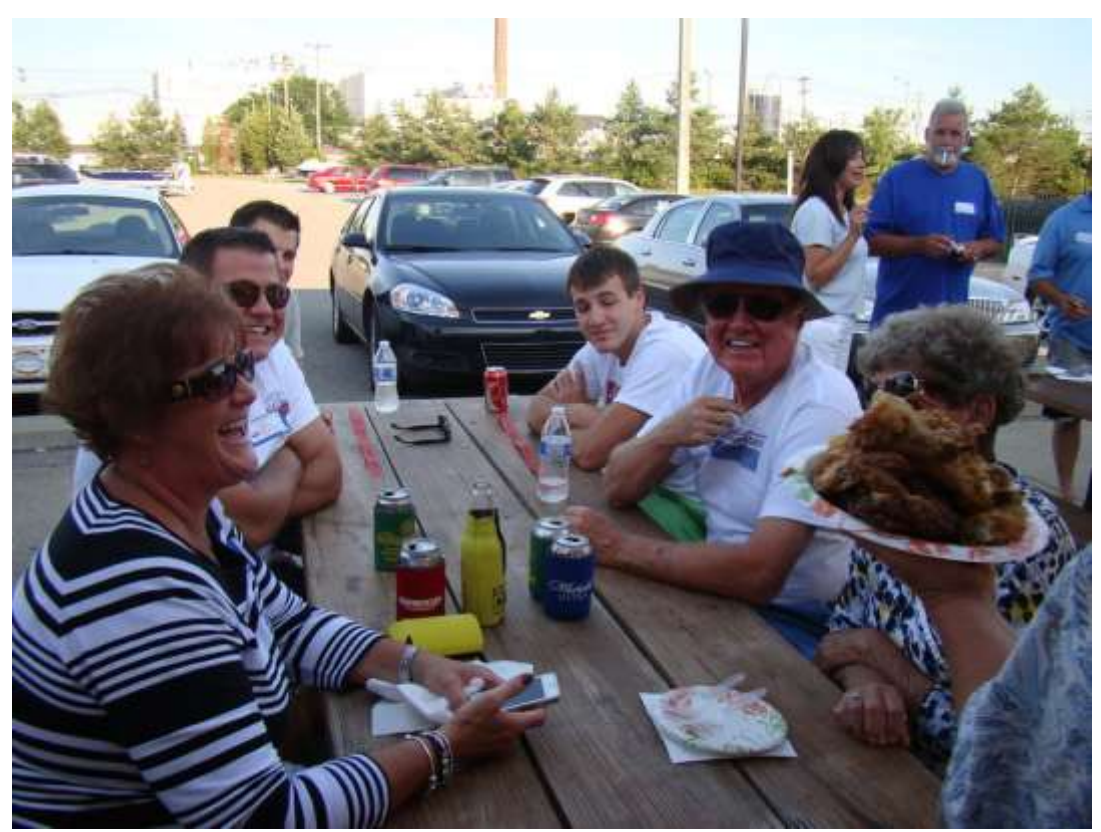
Bompa Boat Crew