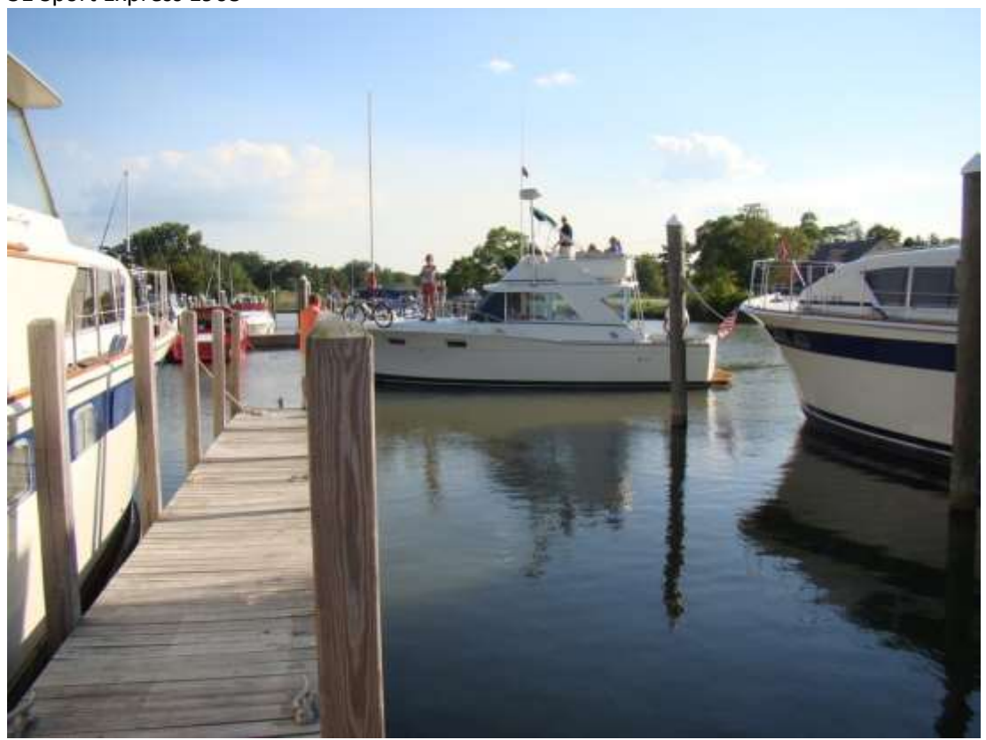
35 Sports Cruiser 1971