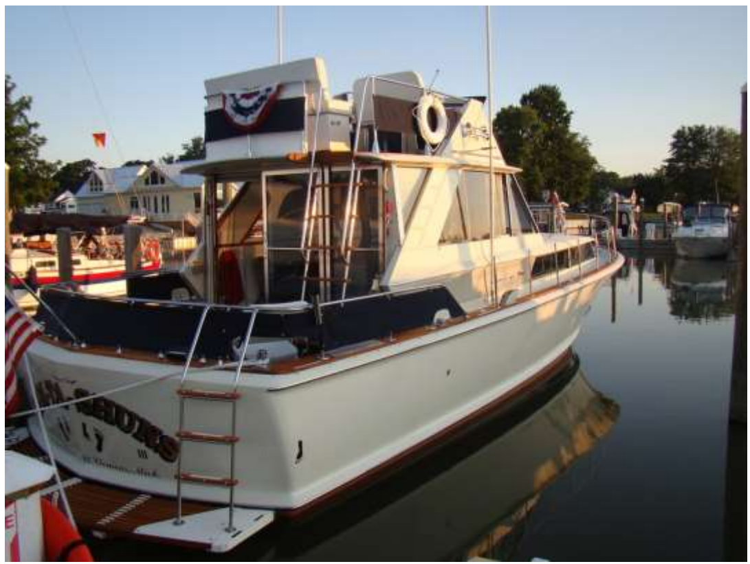
38 Sedan Flybridge 1968