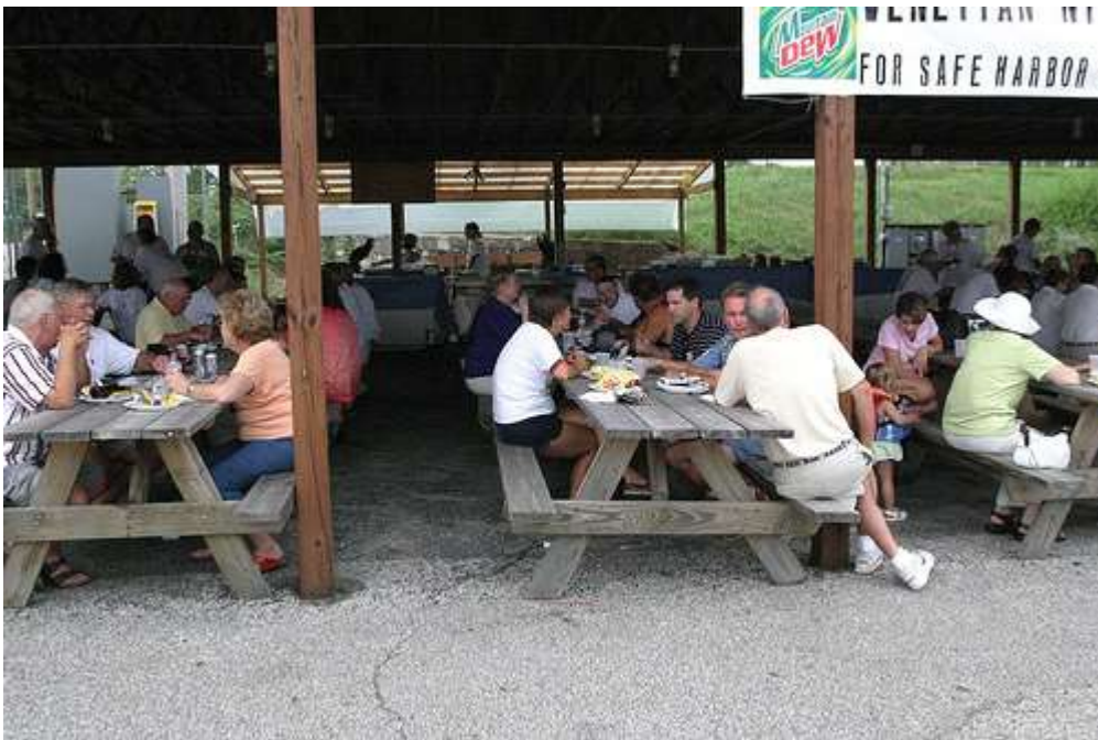
Burger, Brats, and Italian Beef Cookout under the pavilion first night of the meet.