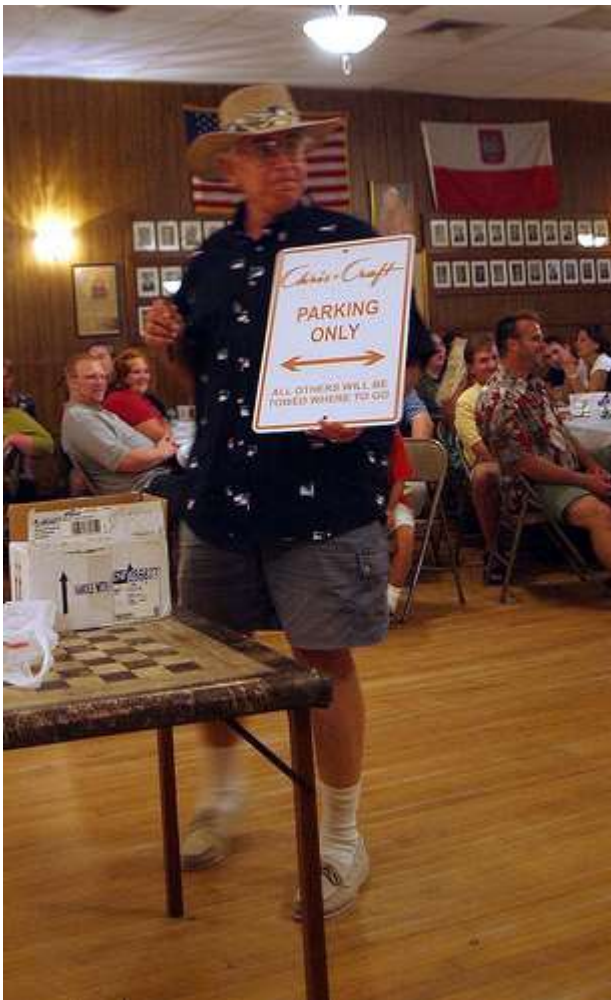
JW auctioning the evening's first item an original Chris Craft parking sign.