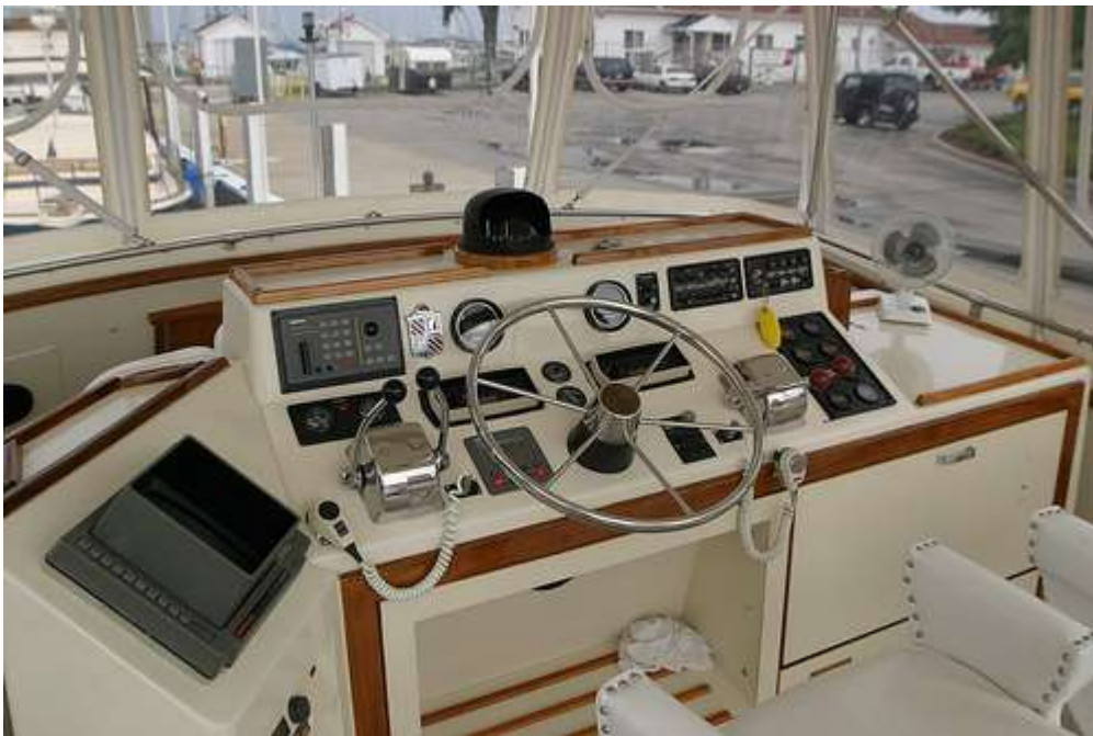
Punch List's flybridge