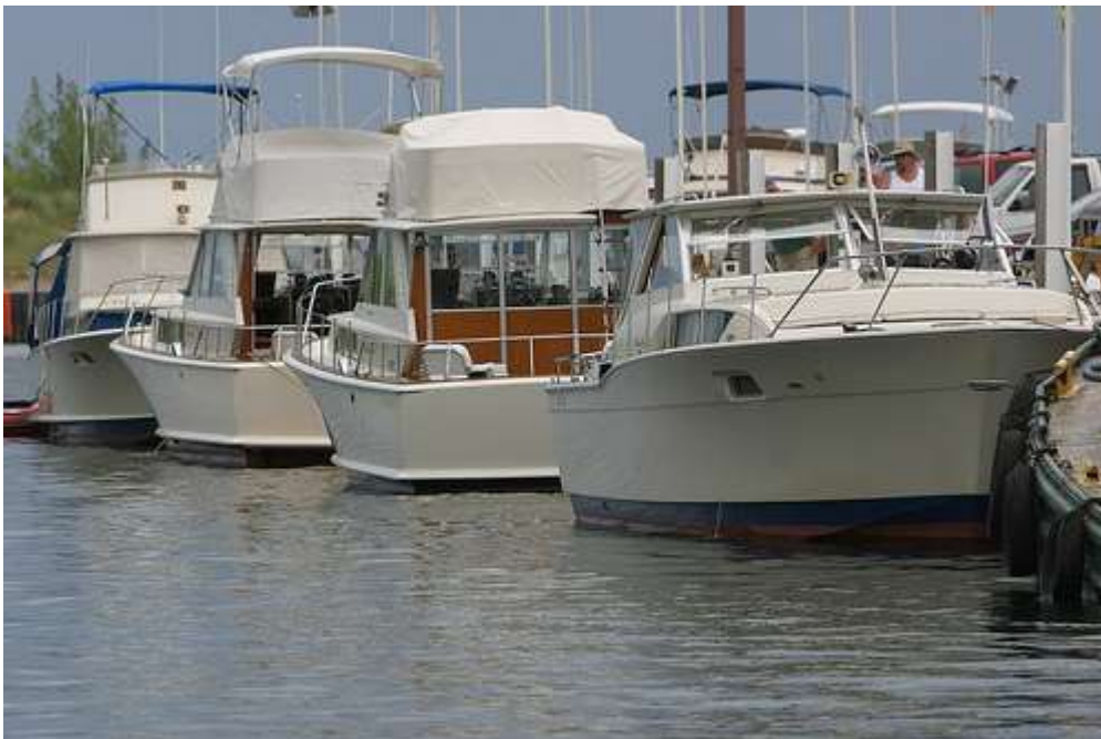
Commanders moored along the seawall at Washington Park Marina.