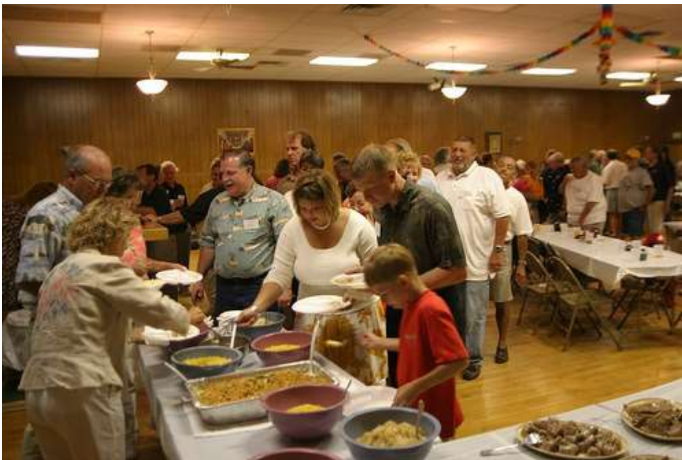
Saturday night dinner party at StJoe's.