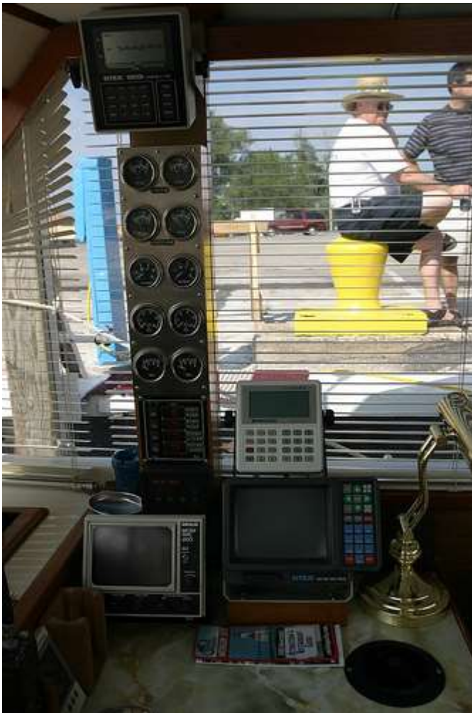
Patty Wagon's marvelous engine surveillance system (middle) and an array of navigational equipment.