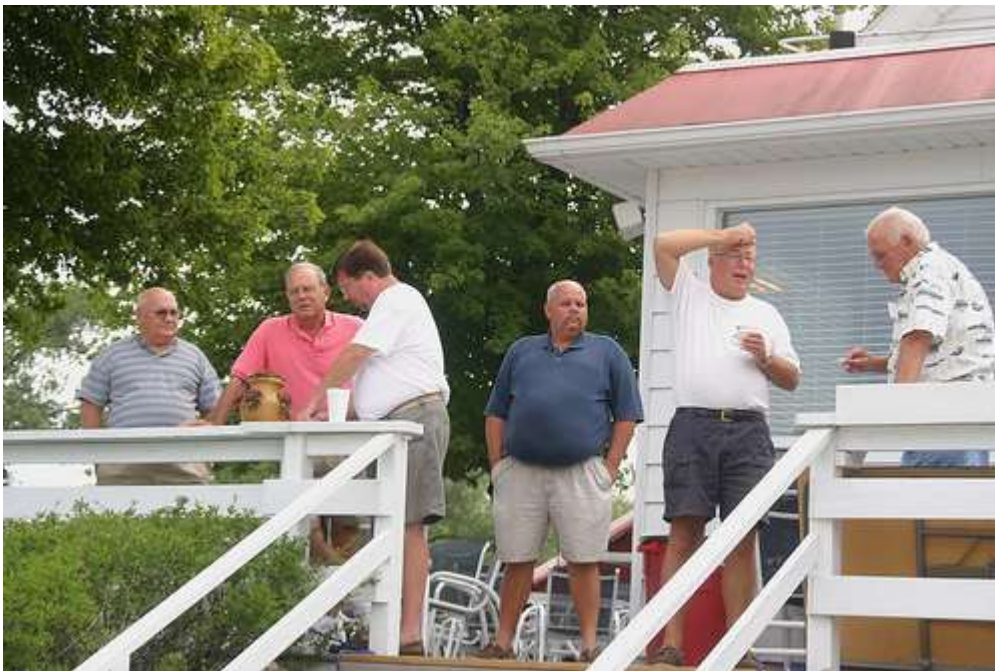
Sunday morning, breakfast and some last minute discussion before breaking up.