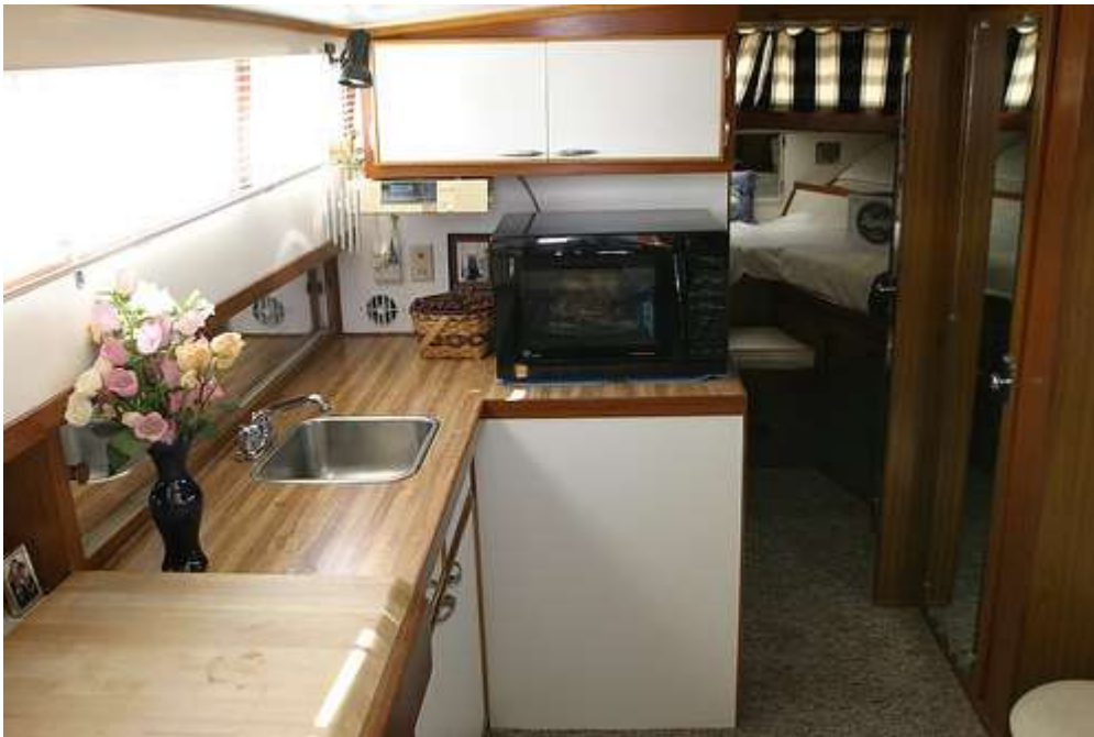
Patty Wagon's galley.