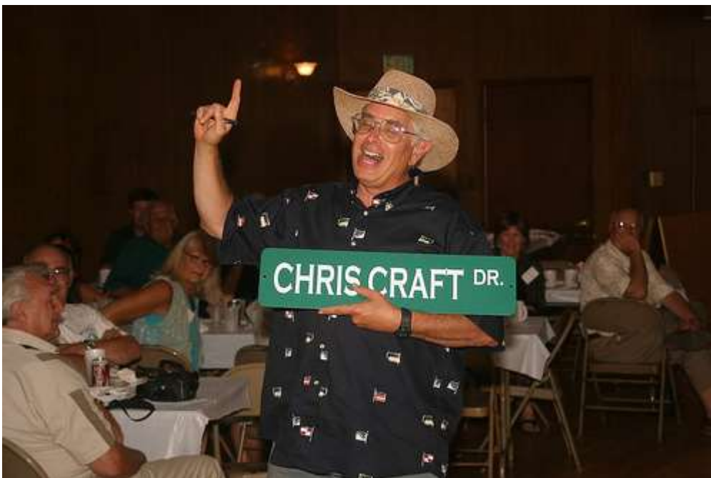
JW auctioning the evening's second item an original Chris Craft Drive road sign