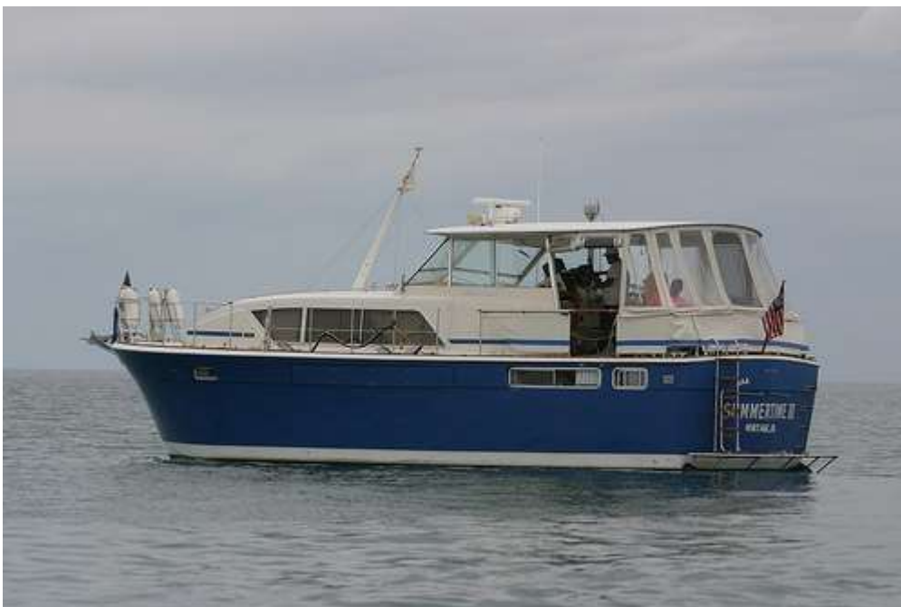
Summertime III, an unusual color 42 Commander.