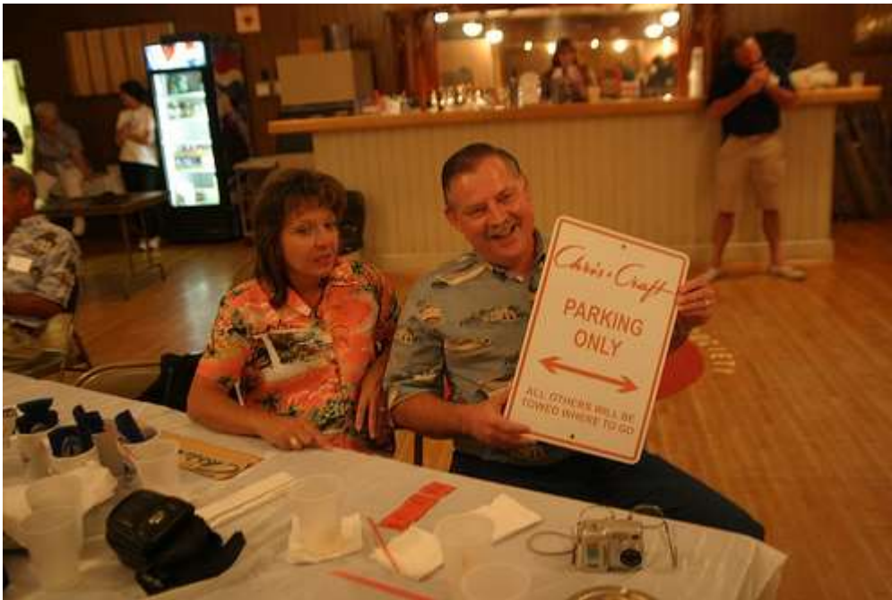
Happy owners of a original Chris Craft parking sign. Is the next home for the sign next to a slip or on the garage wall?!