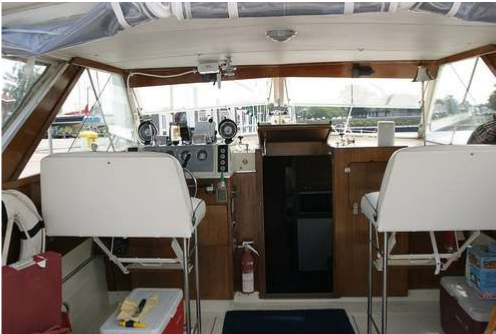
Cockpit of Tim Miller's 35' Commander Timtation