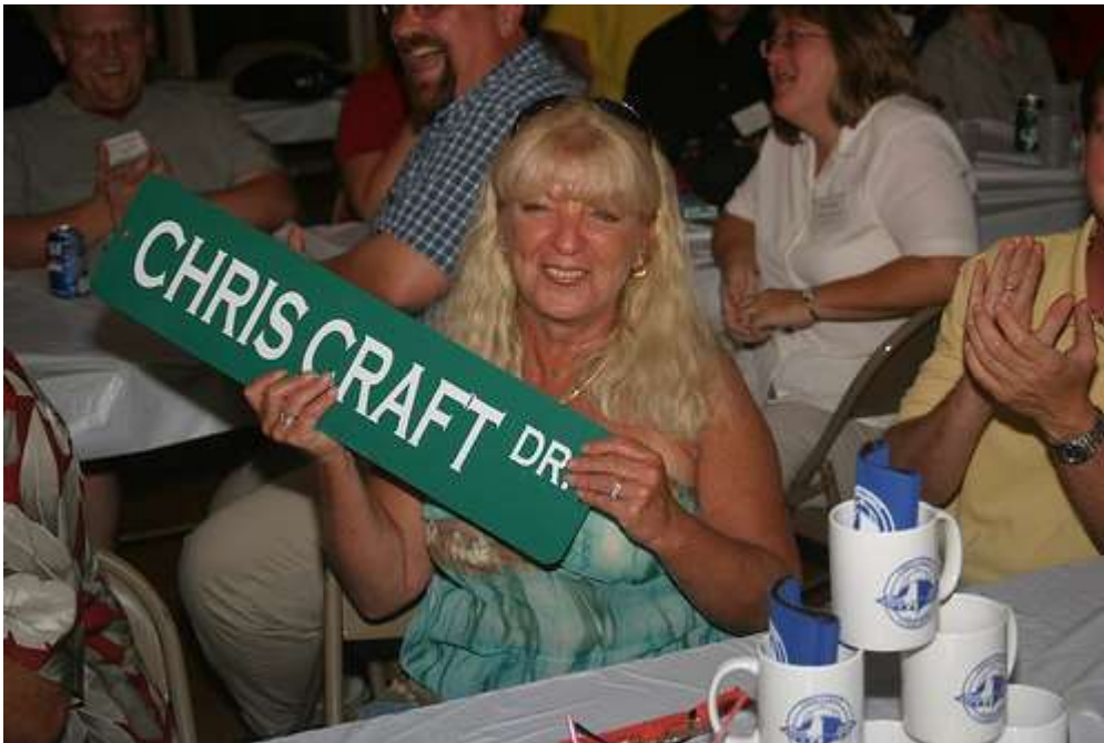
A very surprised owner of the Chris Craft drive road sign. An uncontrolled call resulted in a winning bid of $140!