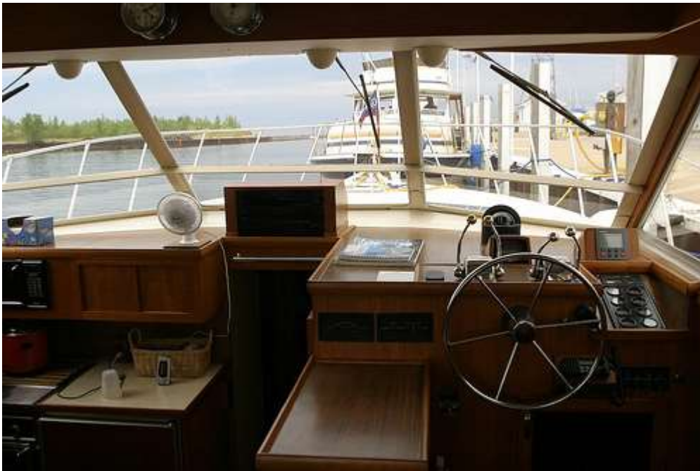
Punch List's lower helmstation.