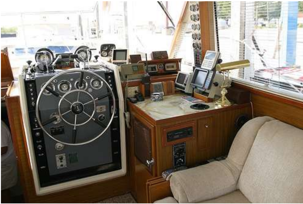
Patty Wagon's helmstation.