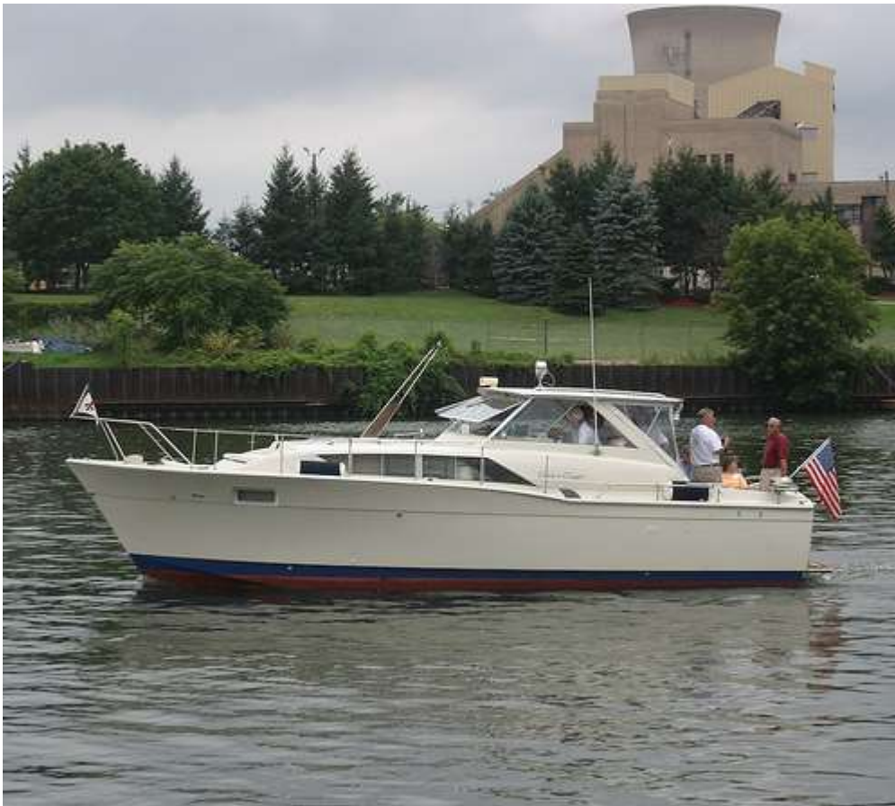
Tim Miller's 35 Commander Timtation going up Trail Creek.