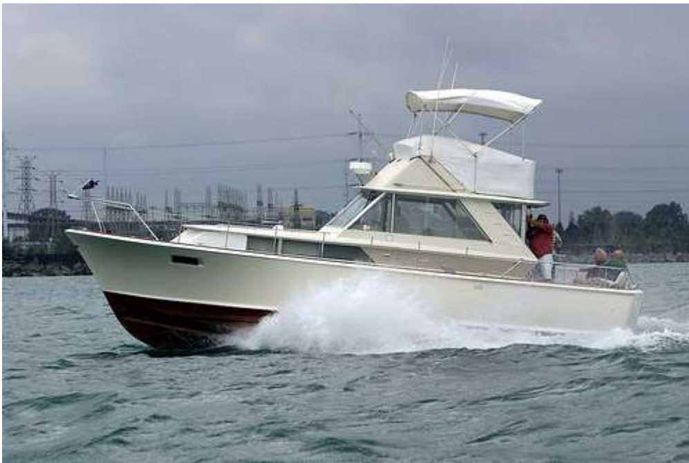
38 Commander Flybridge Sedan Patty Wagon