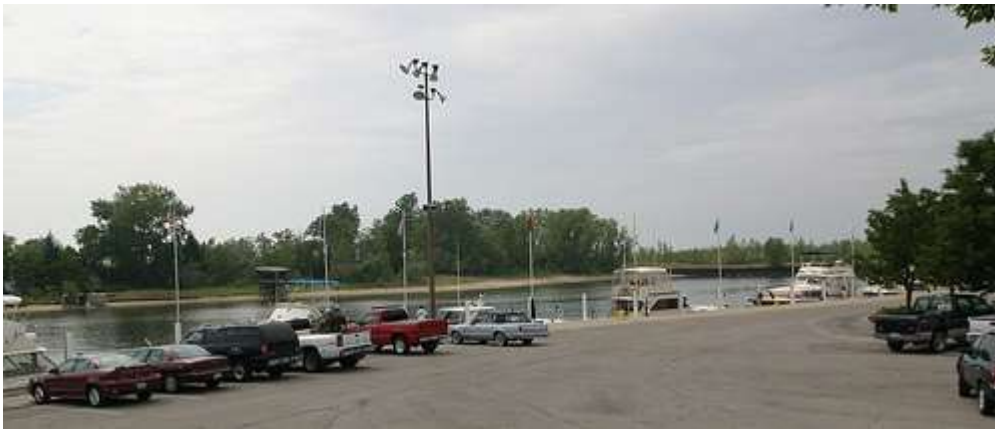
Seawall along the Trail Creek just outside the Washington Park Marina.