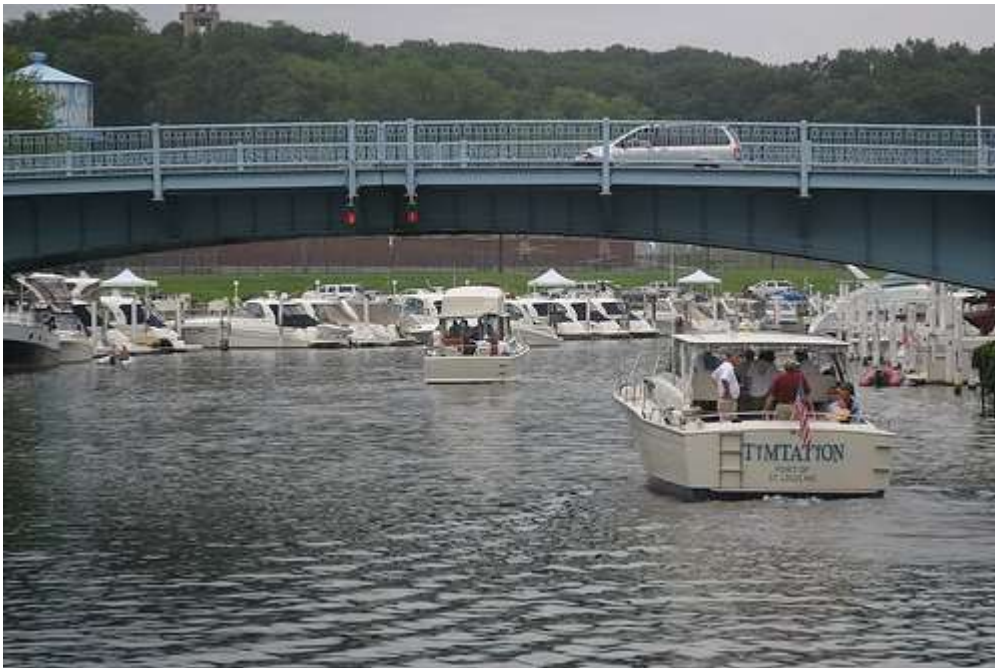
35 Commander Timtation going up Trail Creek following 38 Commander Helo