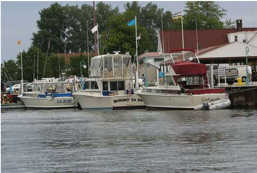
38 Commander Express La-Jo-Be, 382 Commander Brittney Lou Anna , 38 Commander Flybridge Gods Speed