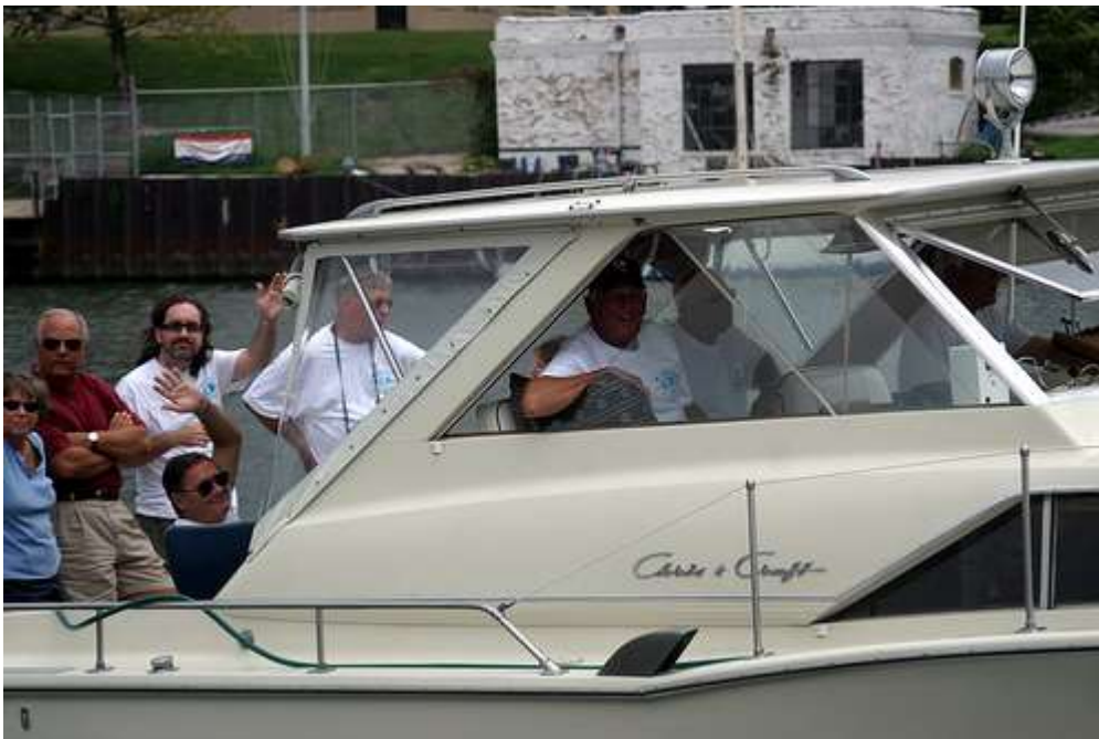
35 Commander Timtation brings a loadful of Commanderos for a trip.