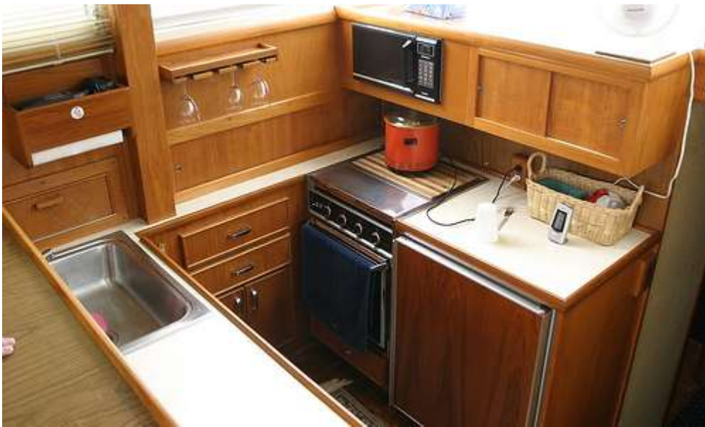
Punch List's galley