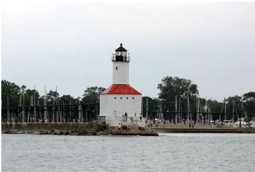
Lighthouse at the entrance to the Washington Park Marina.