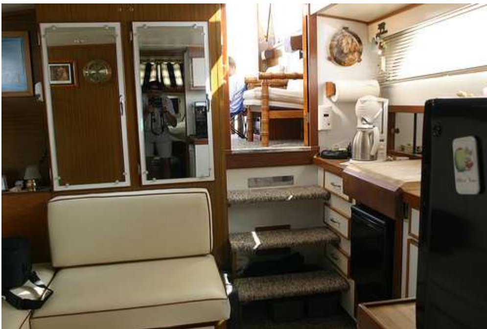
Patty Wagon's galley and gangway to the cockpit.