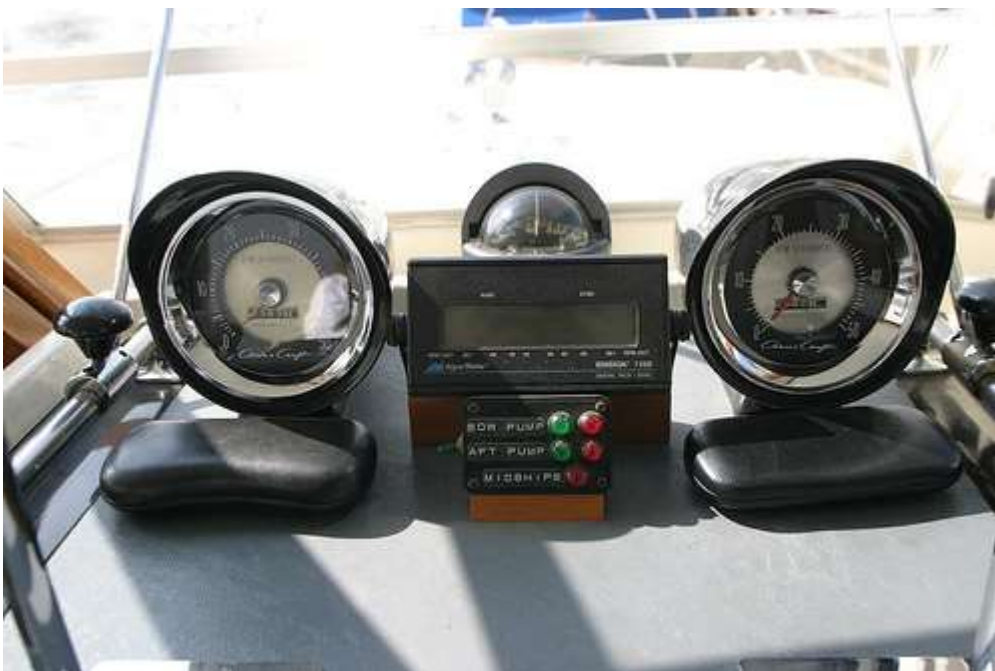
Patty Wagon's neat tach.