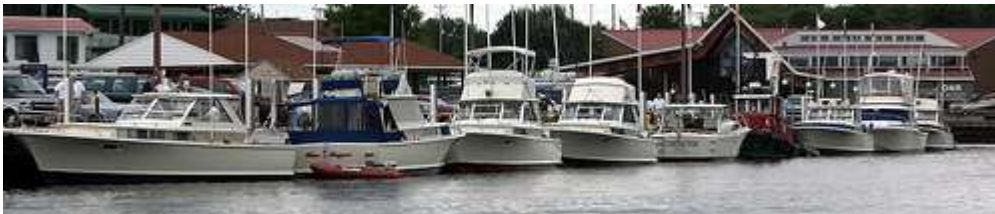
Commanders (+ one ugly tug boat!) moored at the seawall, Trail Creek, Michigan City.