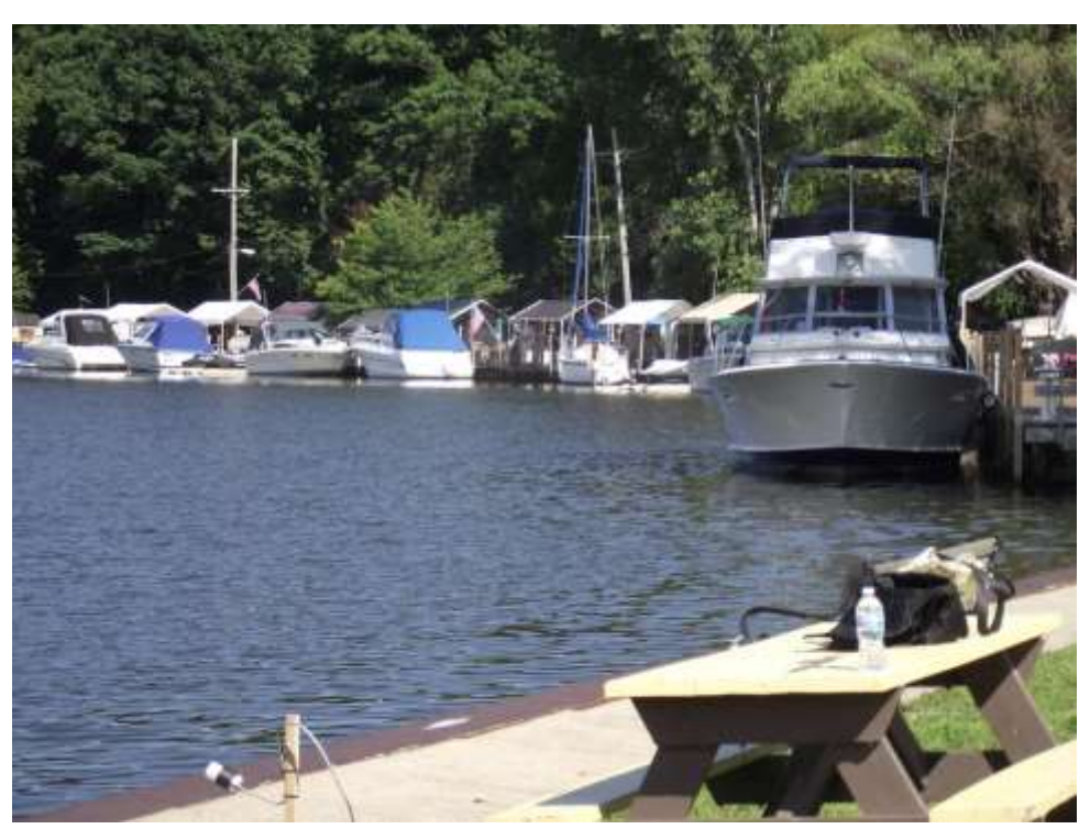
Mentor Lagoons Harbor