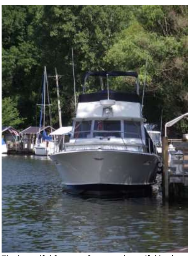
The beautiful Summer Song at a beautiful harbor. Owner: Ron & Pat Smoker