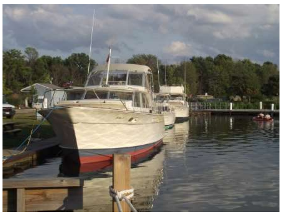
Sun setting on "My Other Honey" and others