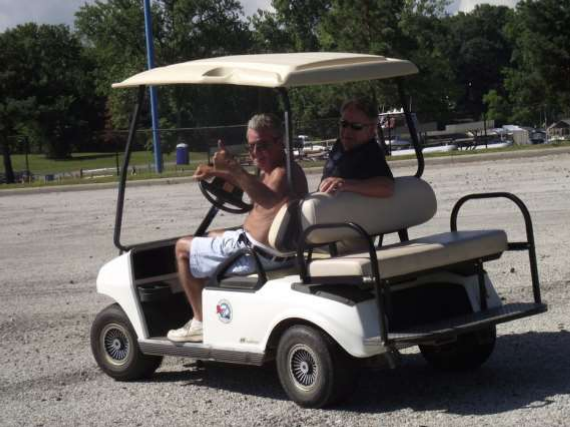
Mentor Lagoons Harbor allowed the club to use several of their golf carts for the weekend. They were so accommodating!!