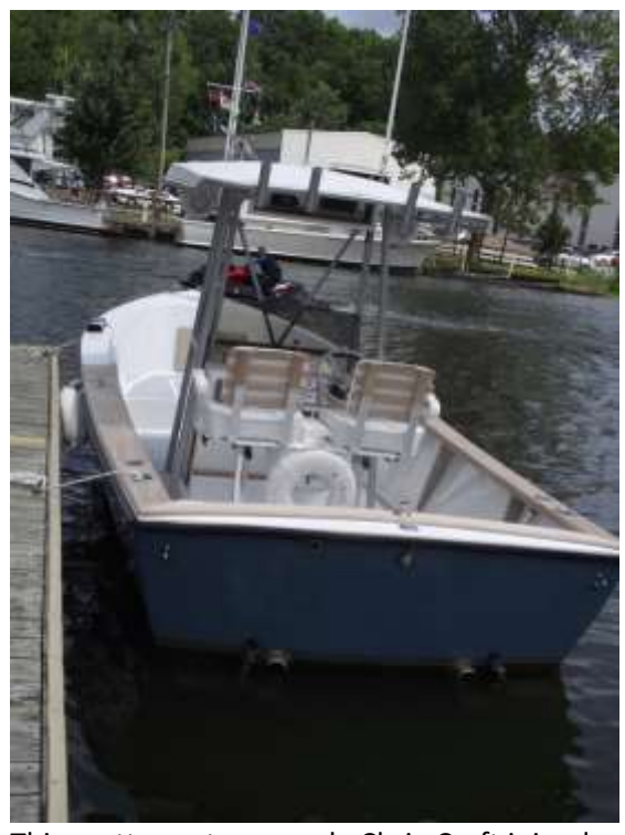
This pretty center console Chris-Craft joined us for the weekend and it was just as slick as a whistle. Word was that the owner had just totally rehab-ed the boat and it showed!!