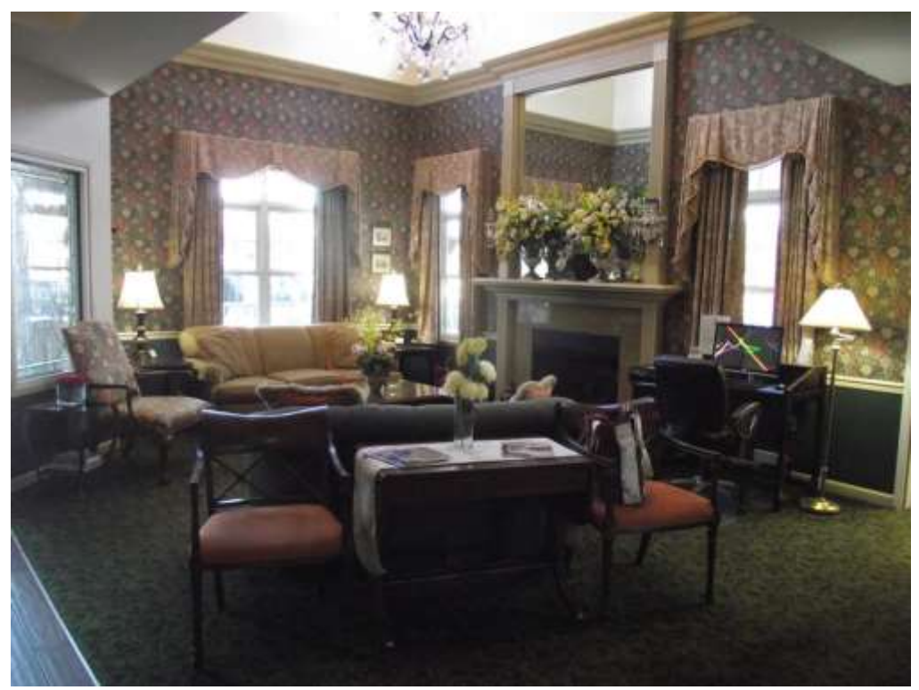
Lawnfield Inn Lobby