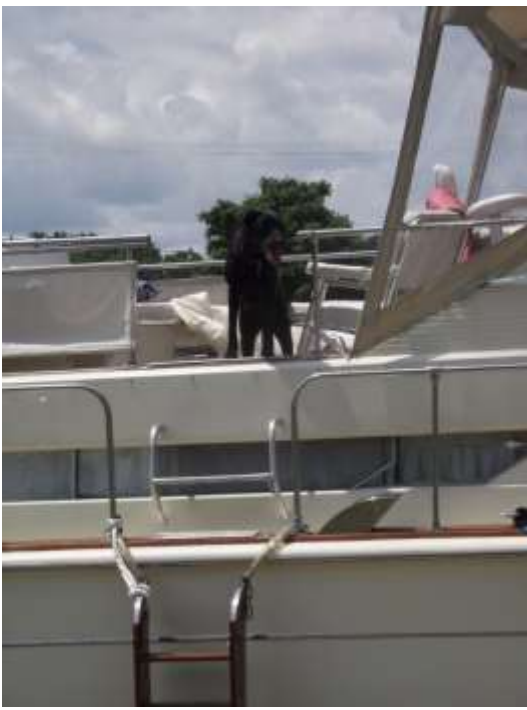
One of the Cannine attendees