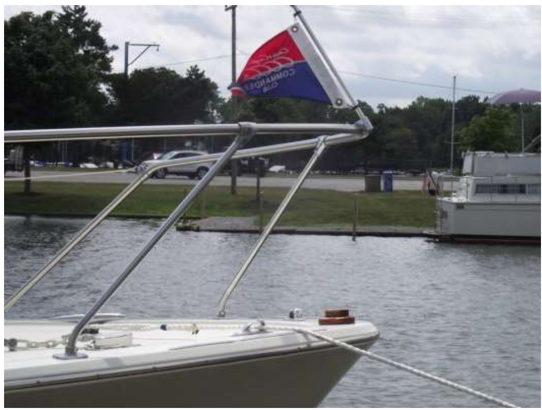
Flying the Commander Club pennant proudly