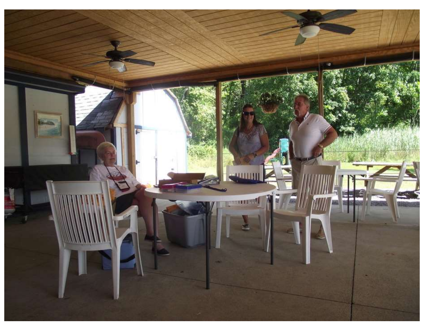
The yacht club allowed us to use their patio for registration and several other activities. Lots of shade, tables and chairs. Char was very happy as we are not always so lucky to have such wonderful facilities