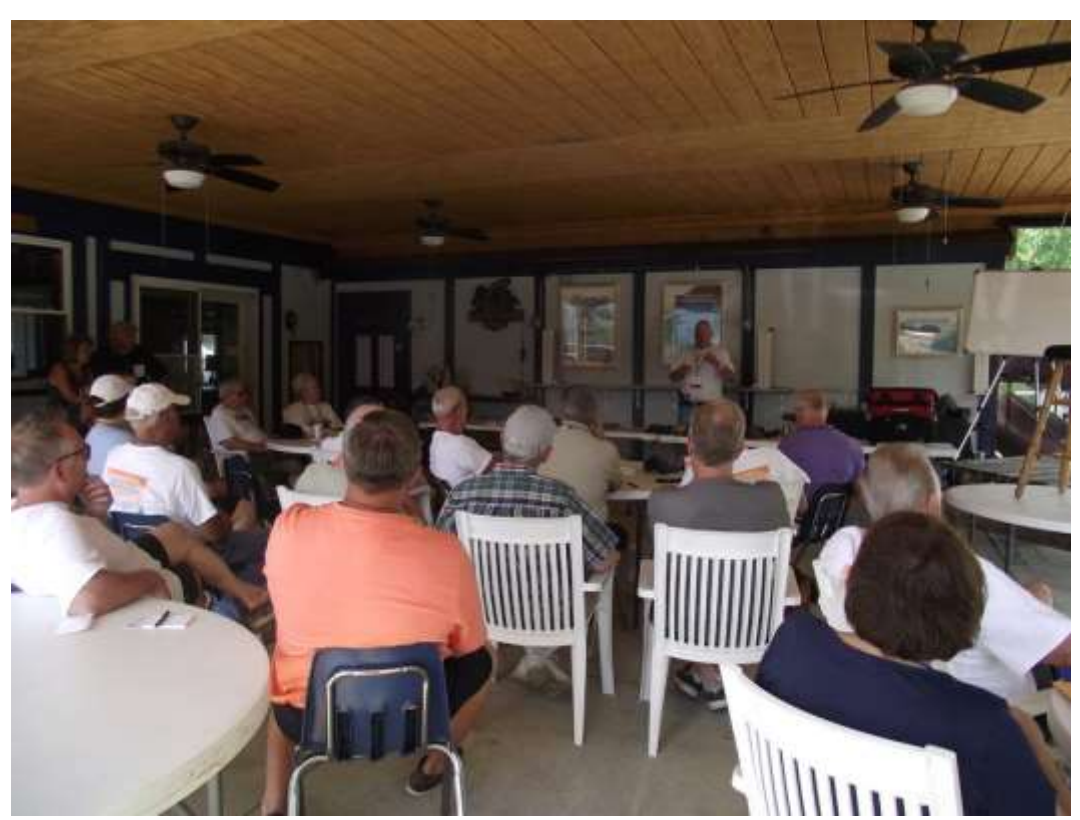
Over 30 people attended the Technical seminar