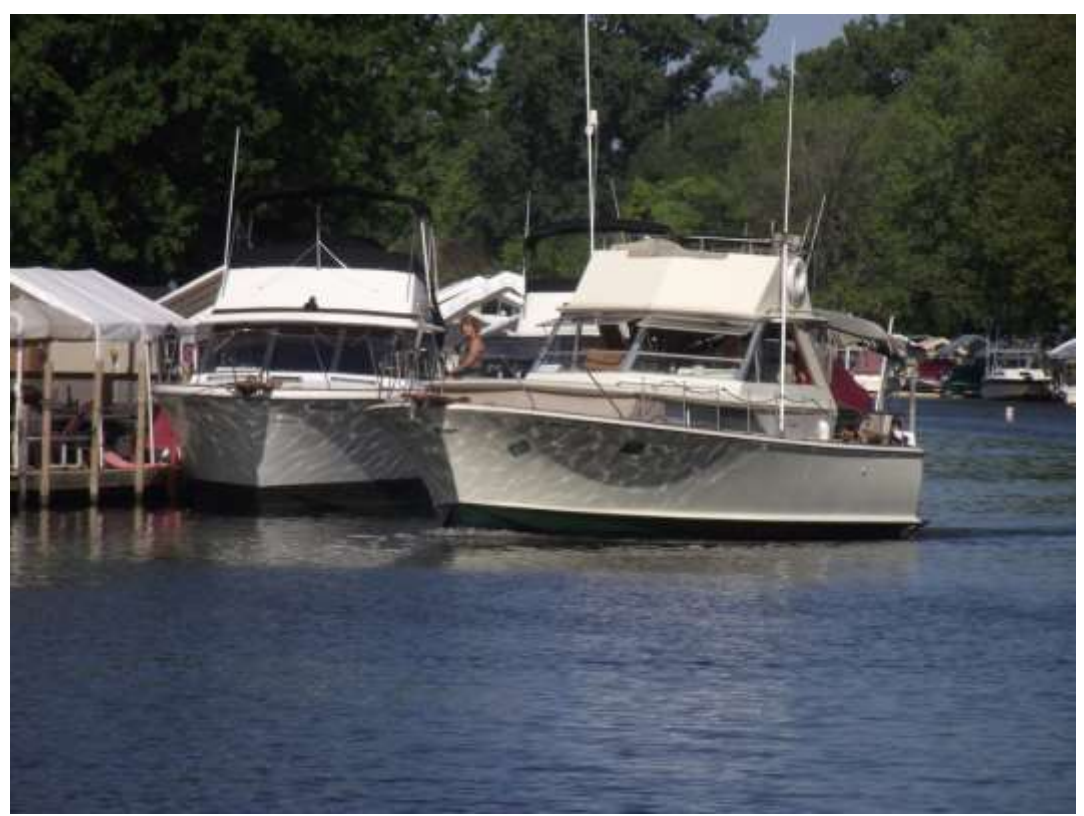
1967 38' Express Julie Ann arriving in Mentor, Ohio