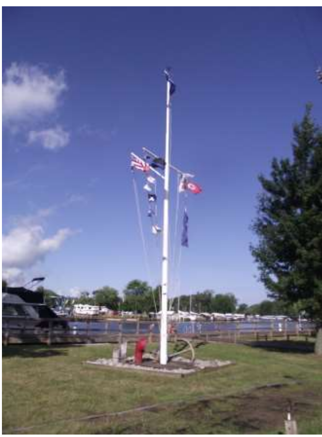
Mentor Yacht Club Entry