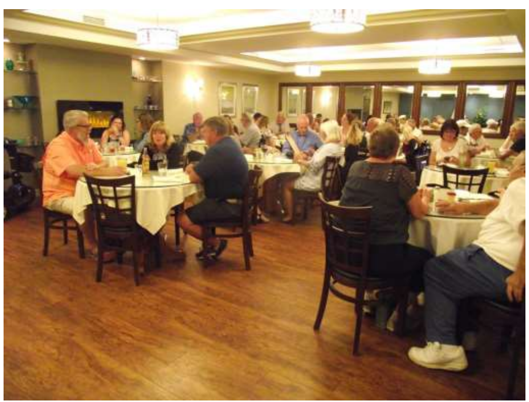
Saturday Night's Dinner at the Lawnfield Inn & Suites