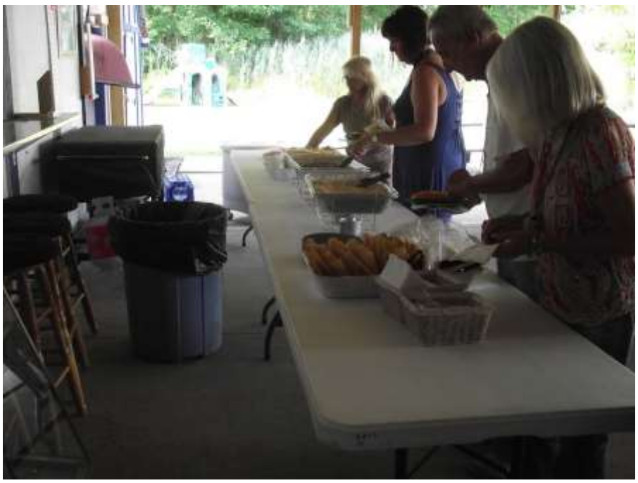
Wonderful taco buffet provided by the Skye Bistro. So good!!