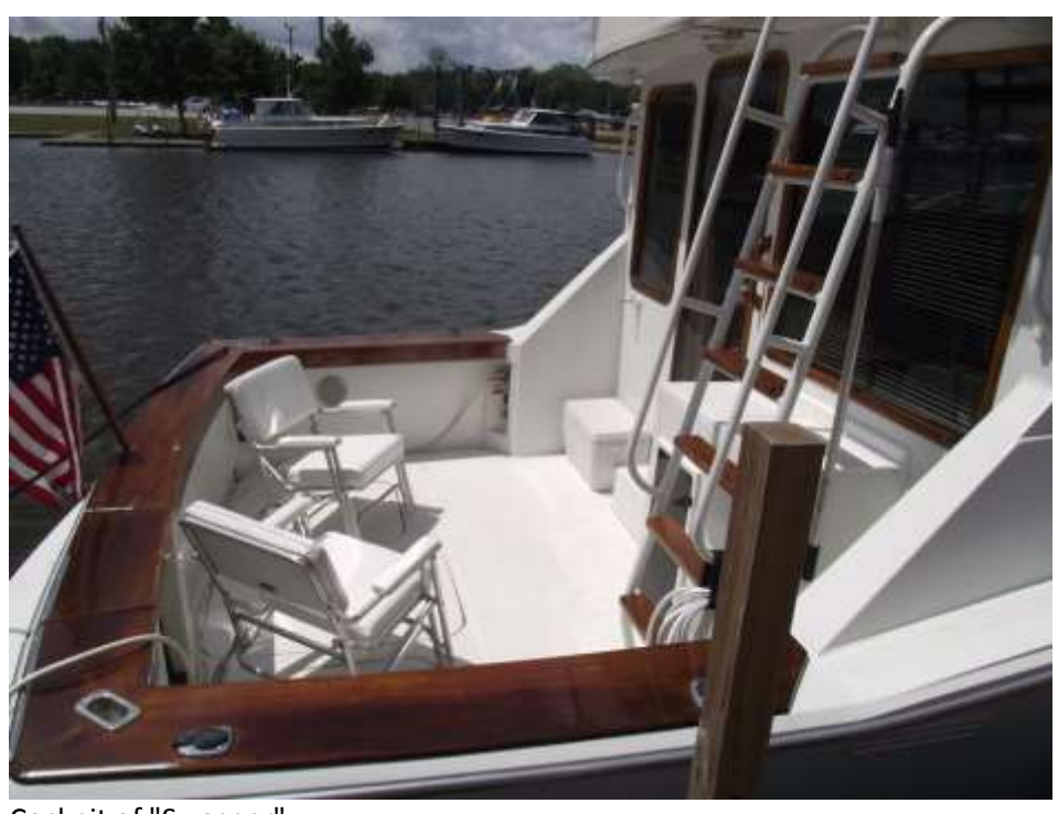
Cockpit of "Swagger"