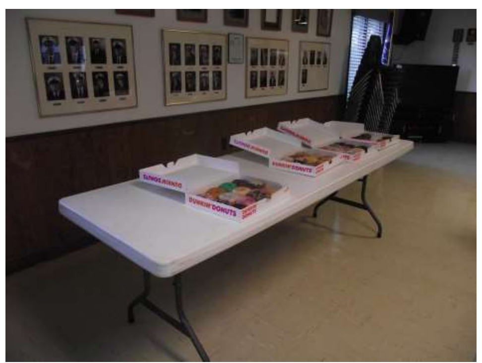
Breakfast provided by the Yacht Club