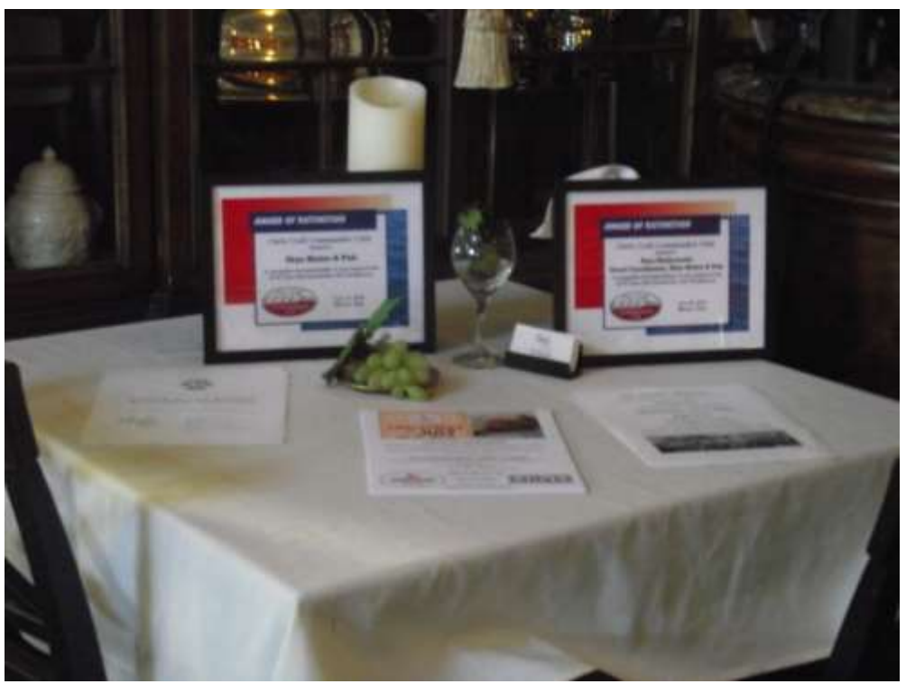
The Commander Club presented several awards to our host hotel and they displayed them proudly in their lobby.