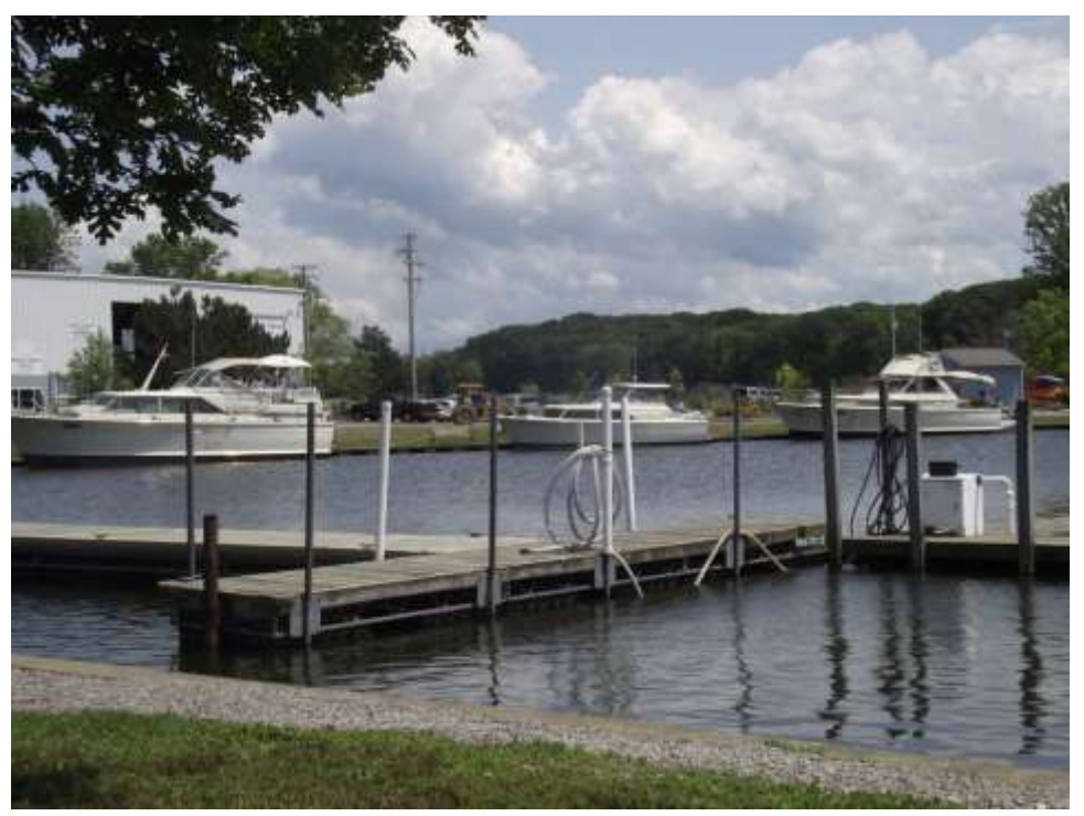
42, 31 & 38!