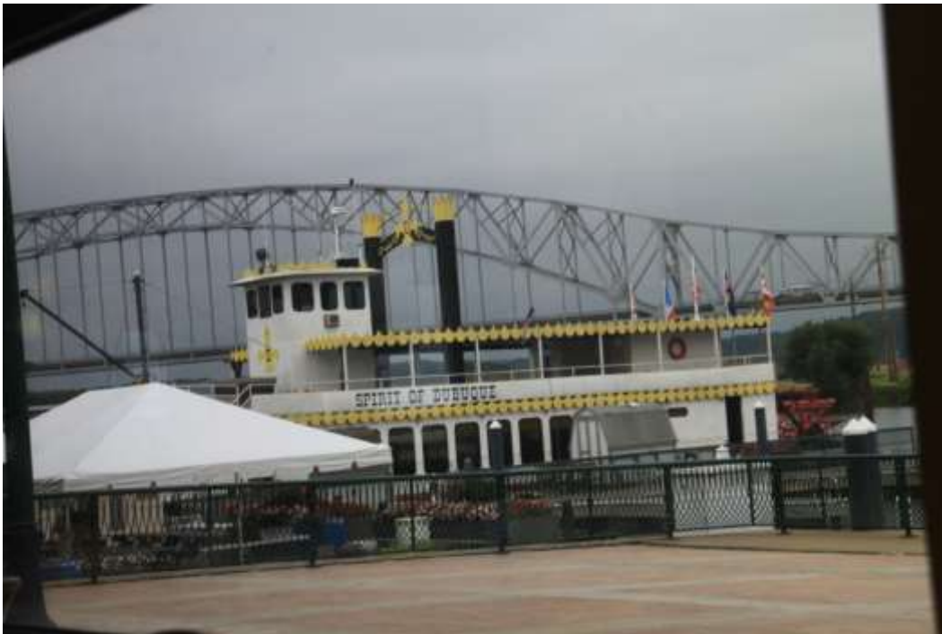
This marina has several cruises that originate here. The Spirit of Dubuque is a functioning paddle wheel boat, that does Lunch, Sightseeing, and Dinner cruises.