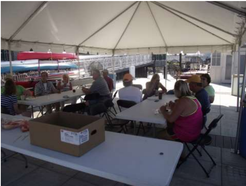
One last gathering before getting on the road and river to return home.