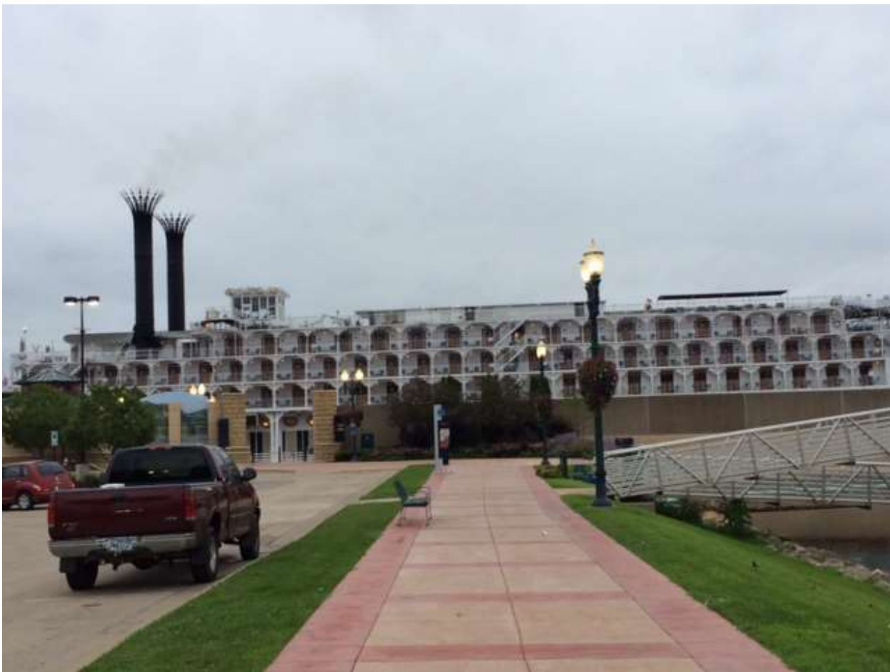
The American Queen. Huge paddle wheel boat that cruises up and down the Mississippi River. Such a pleasure