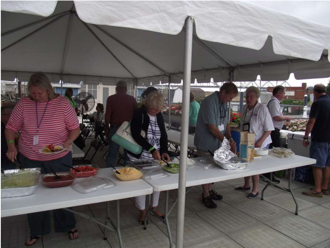
Friday taco dinner