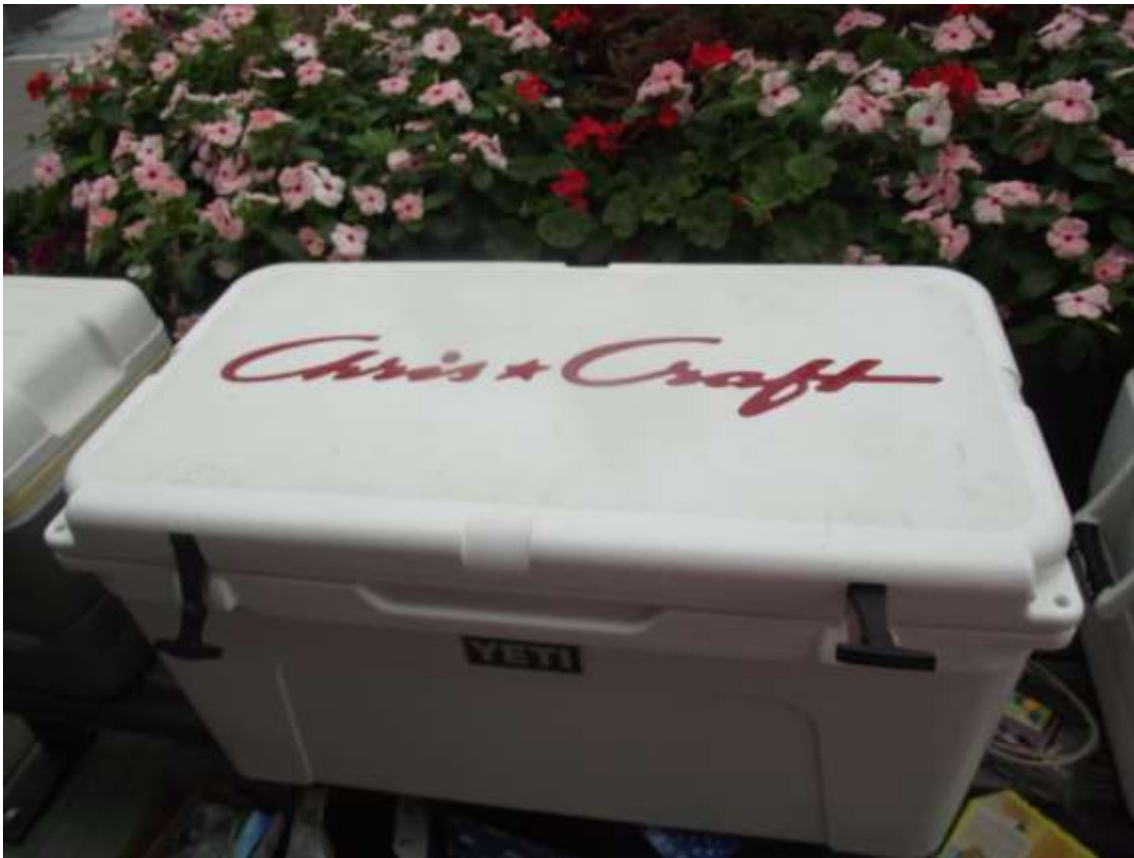
Cocktails were served in the awesome cooler. It was too heavy for me to steal, unfortunately