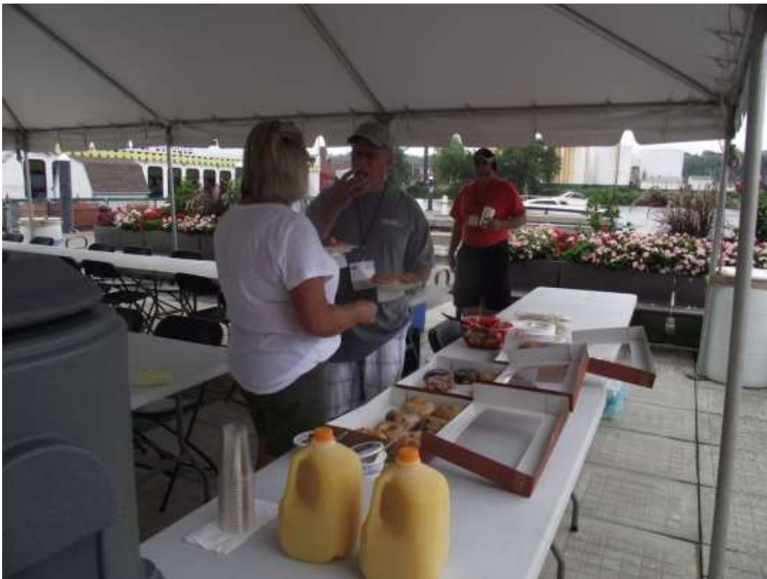
Saturday morning breakfast