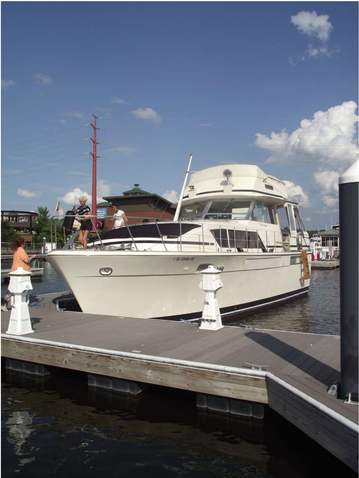
Miss Tress Ariving