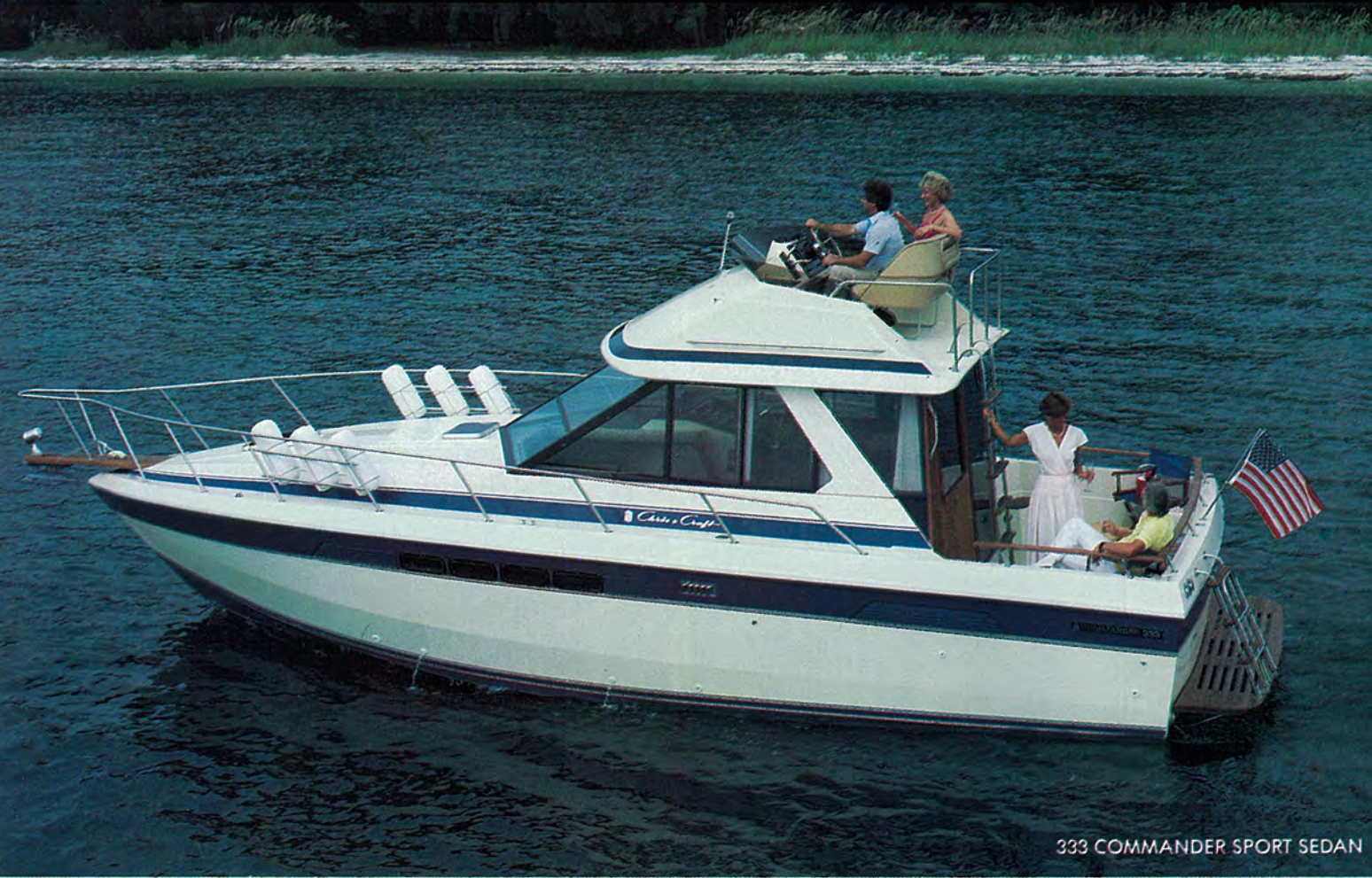
333 COMMANDER SPORT SEDAN