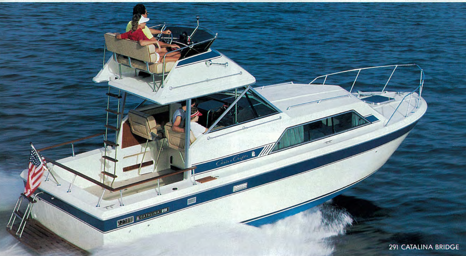
291 CATALINA BRIDGE