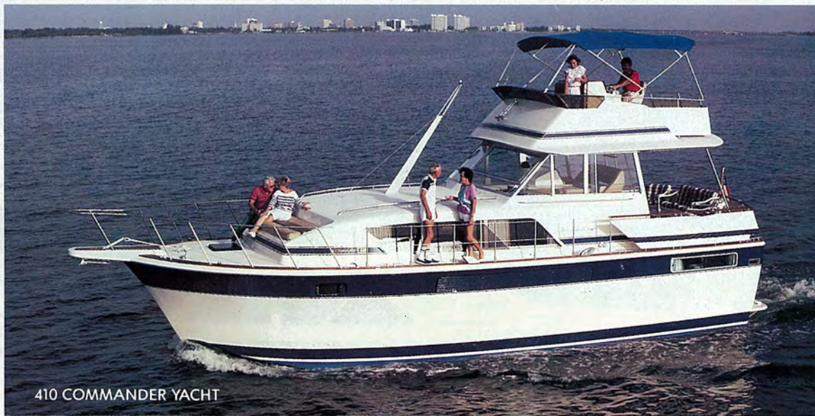
410 COMMANDER YACHT