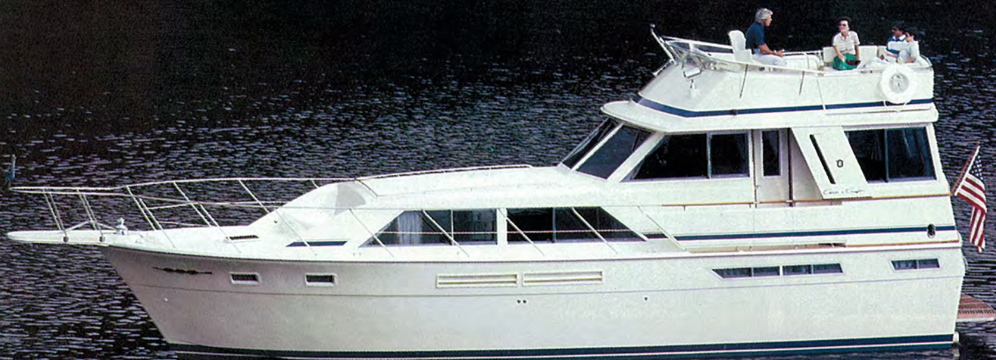
460 CONSTELLATION MOTOR YACHT