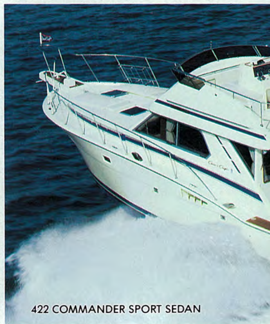
422 COMMANDER SPORT SEDAN