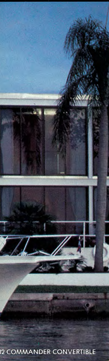
32 COMMANDER CONVERTIBLE