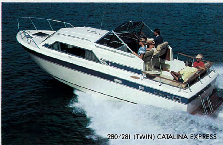
280/281 (TWIN) CATALINA EXPRESS