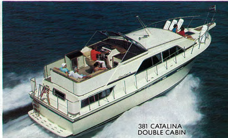
381 CATALINA DOUBLE CABIN