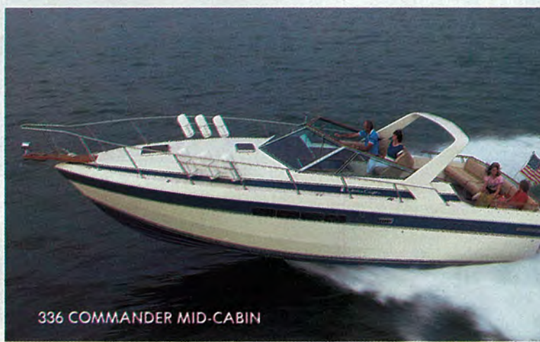
336 COMMANDER MID-CABIN