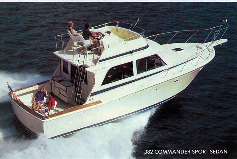
382 COMMANDER SPORT SEDAN