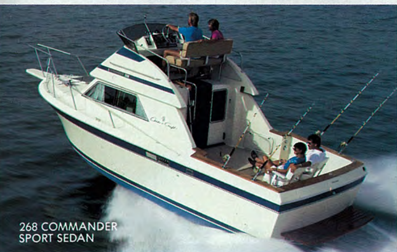
268 COMMANDER SPORT SEDAN