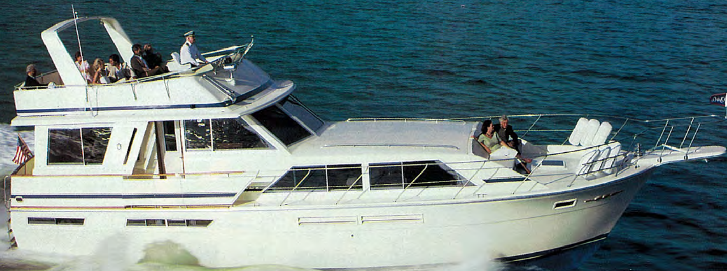
500 CONSTELLATION MOTOR YACHT