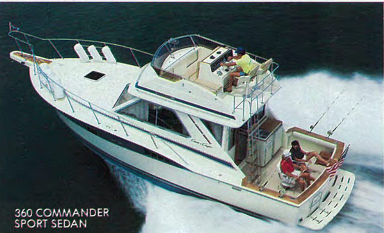
360 COMMANDER SPORT SEDAN