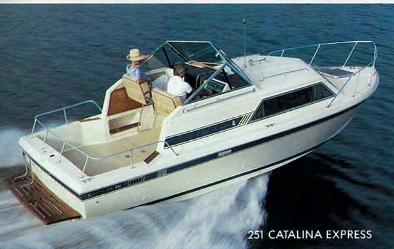
251 CATALINA EXPRESS