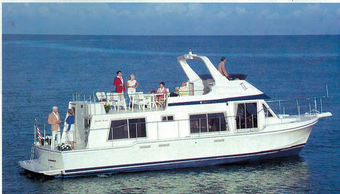
450 YACHT HOME