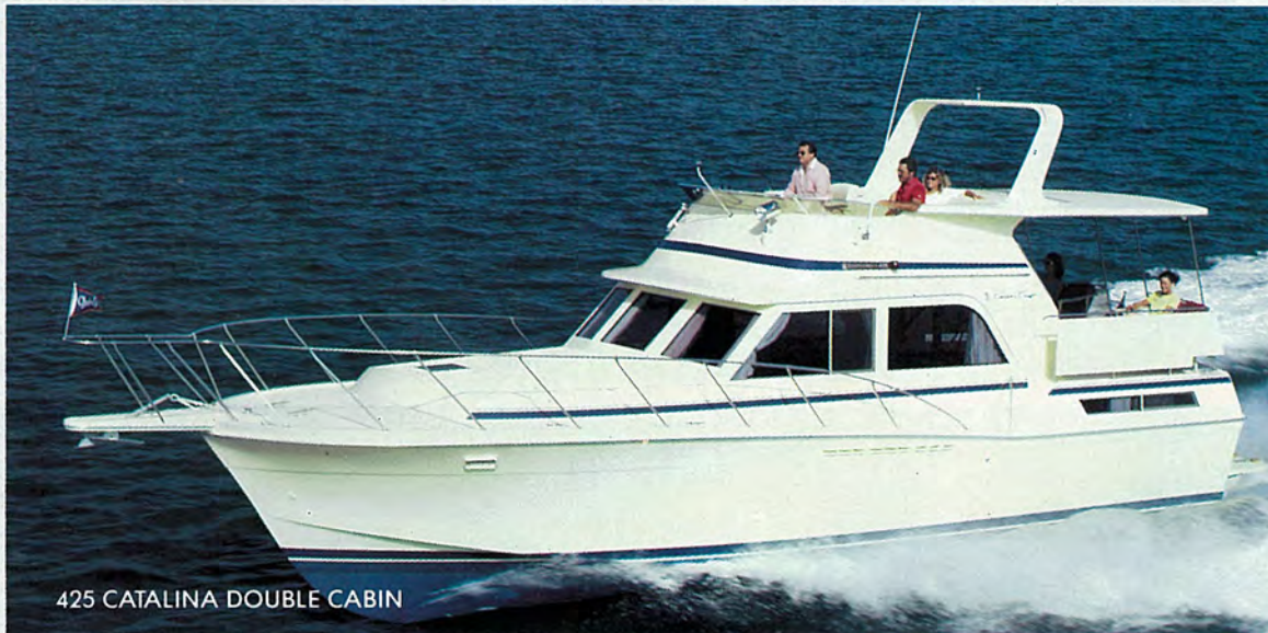
425 CATALINA DOUBLE CABIN