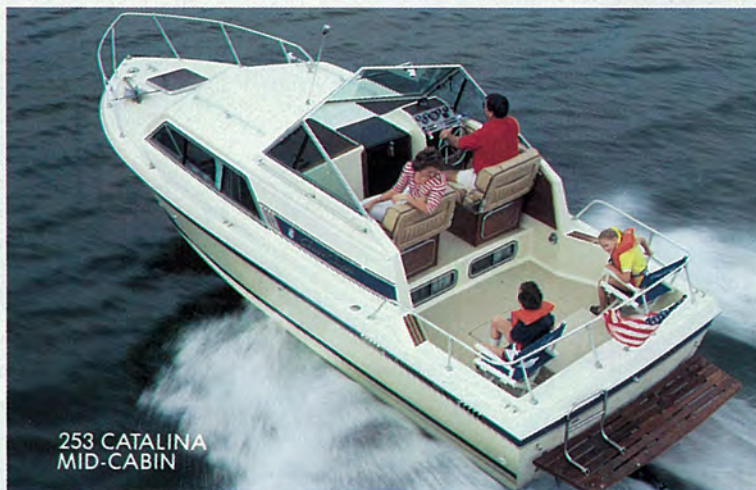
253 CATALINA MID-CABIN