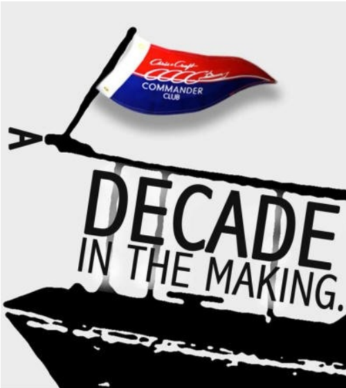
THE OFFICIAL CHRIS-CRAFT COMMANDER CLUB BURGEE 100% CUSTOM EMBROIDERED QUALITY NYLON PENNANT WITH CANVAS HEADING & BRASS GROMMETS $45.00 INCLUDES SHIPPING. COMMANDERCLUB.COM/BURGEE

The Official Club burgee is 100% custom embroidered quality nylon pennant with canvas heading & brass grommets.