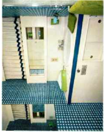
Master stateroom lavatory. Lift-up section of countertop conceals a handy medicine chest. For convenience, the shower in each aft lavatory has a fiberglass seat.