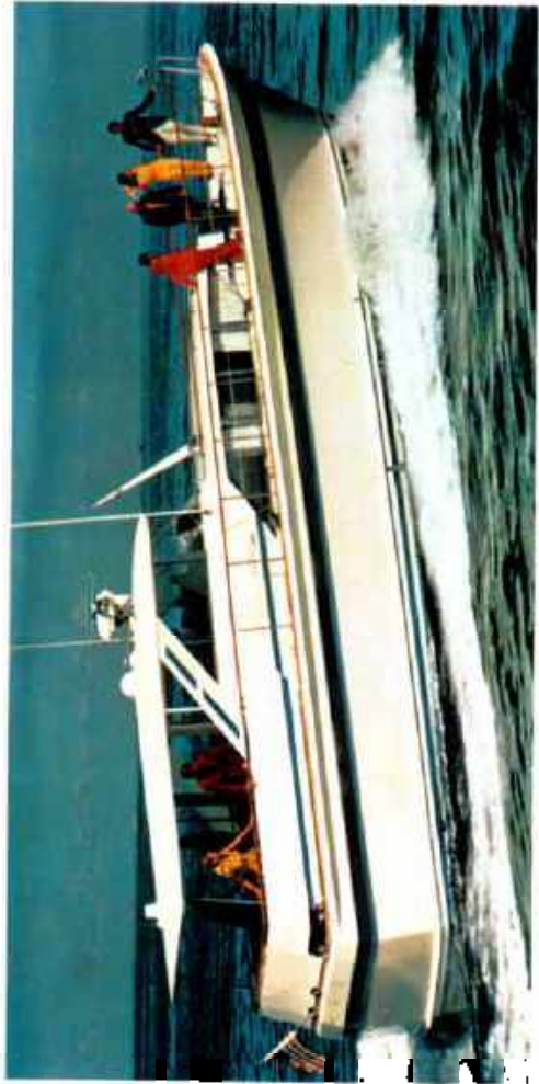
The long, low silhouette of the 55' Commander seems to promise the superlative performance that she delivers. On-deck areas are broad and well protected for sunbathing and moving fore and aft.