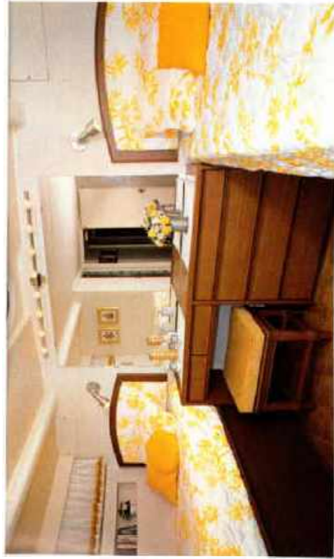
Looking aft in the master stateroom. To starboard is an adjoining lavatory with an enclosed stall shower. Note theatrical lighting on mirror.