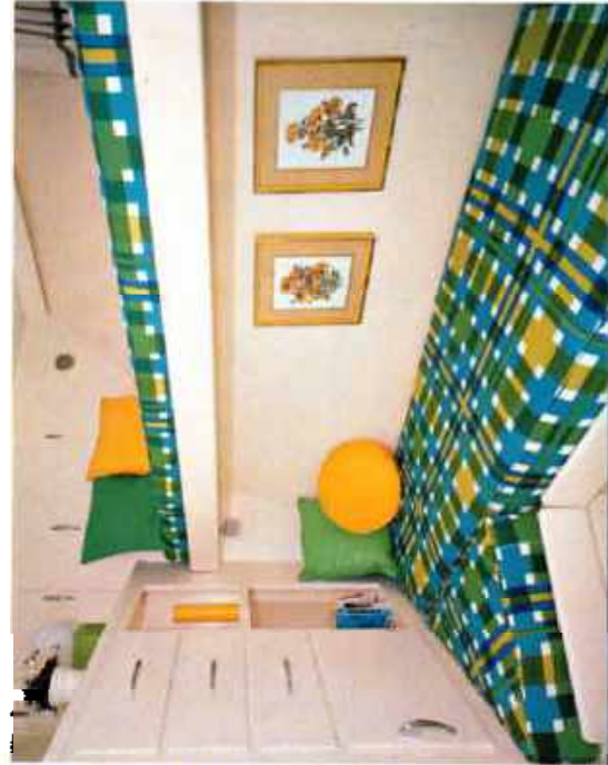
Forward stateroom has adjoining lavatory (shower optional) and plenty of storage space.