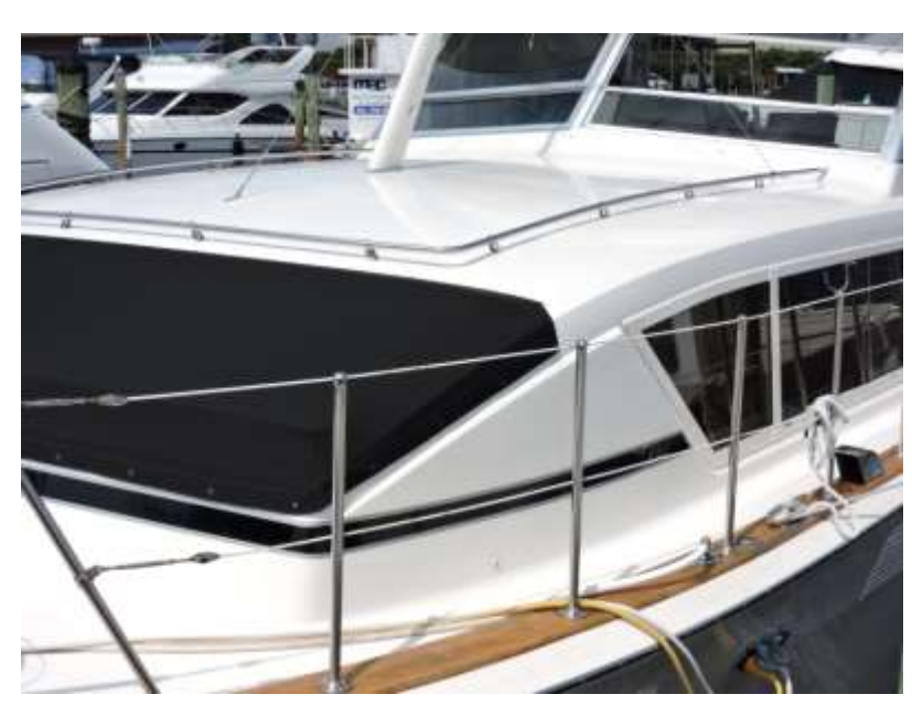
PIZZAZ Update (stripes)