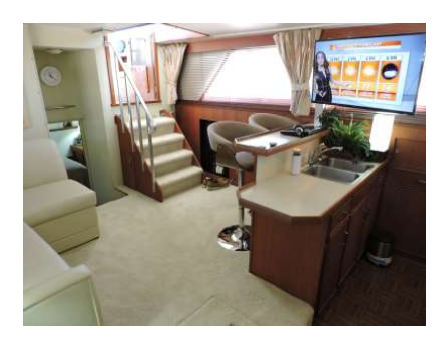
PIZZAZ update...41 Commander TV install

Paul Cavenaugh Photos Page Main Salon before and after