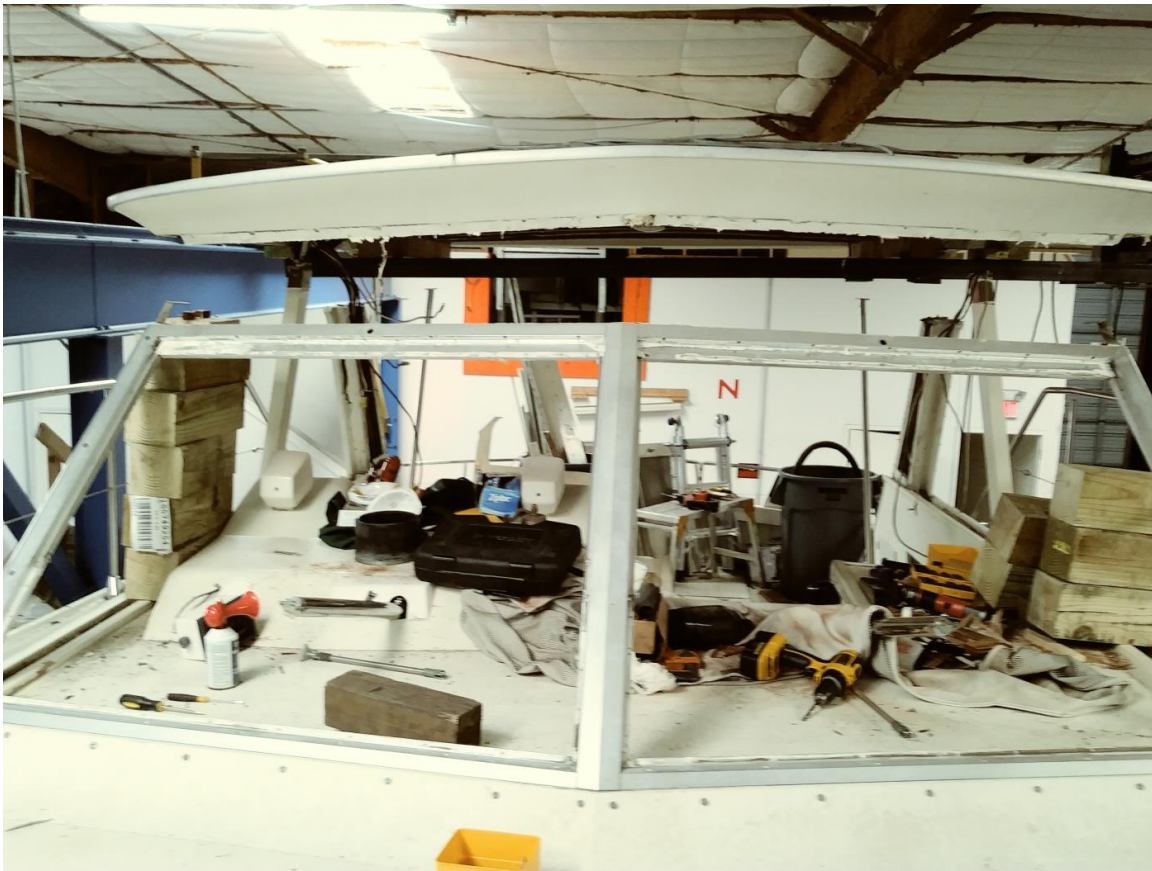
Here is immediately after separation